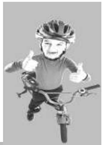
Promote active fun with your kids with Toy Kingdom's Hooray for Play collection.