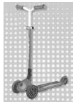
Globber Master 3-Wheel foldable scooter.

Check out the Toy Kingdom's Hooray for Play Collection in-store or on their website at www.toykingdom.com.ph and order now thru their Call to Deliver services at 0917.5578797 and have a personal shopper assist you. Follow ToyKingdomPH in Facebook and