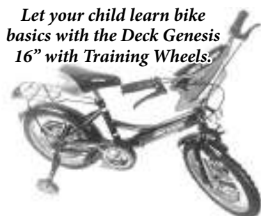
Let your child learn bike basics with the Deck Genesis 16" with Training Wheels.