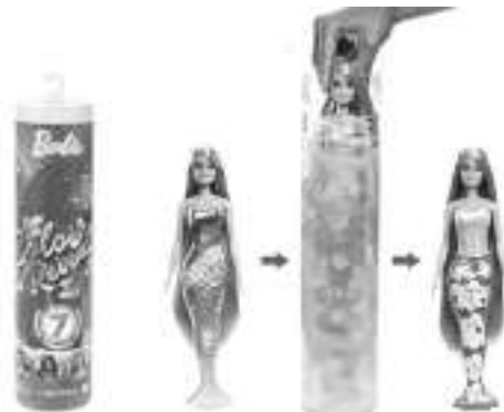
Unbox the surprises with the latest Barbie Color Reveal Rainbow Mermaid Series.