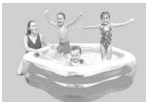
Enjoy a summer splash with the family with this Intex Summer Color Pool.