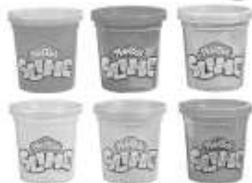
Stay creative and playful with