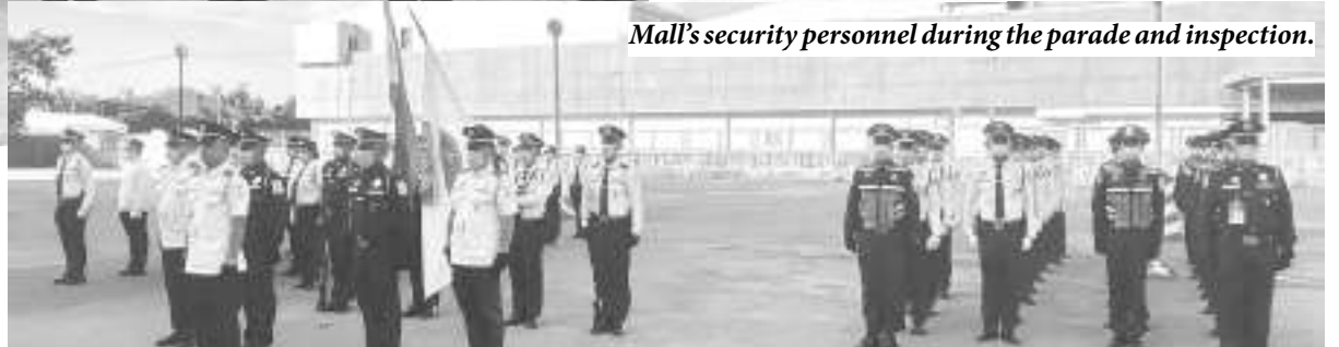
Mall's security personnel during the parade and inspection.

To ensure the safety of all its customers and clients, SM City Calamba conducted a General Guard Formation as a part of their corporate responsibility to provide complete customer service.