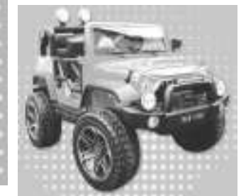
Rux Motorized Off-Road Cruiser

Explore the great outdoors and say Hooray for Summer fun with amazing play-mates from Toy Kingdom. Here are Toy Kingdom's 10 Top Toys that will make this summer exciting and memorable.