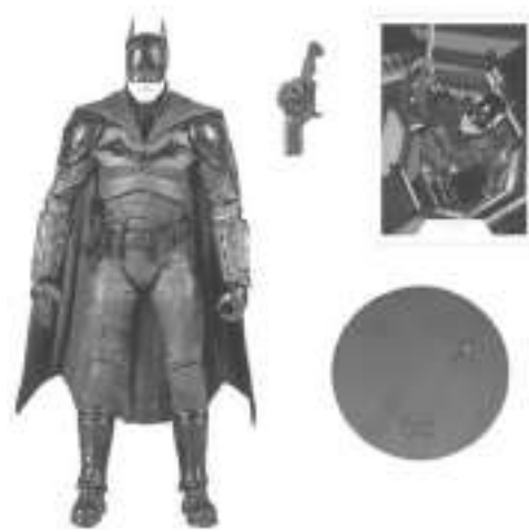
The Batman's back! Incredibly detailed 7" scale McFarlane DC Comics Multiverse Batman figure is designed with ultra-articulation as his posture and look in the upcoming The Batman movie. Available in select Toy Kingdom stores.