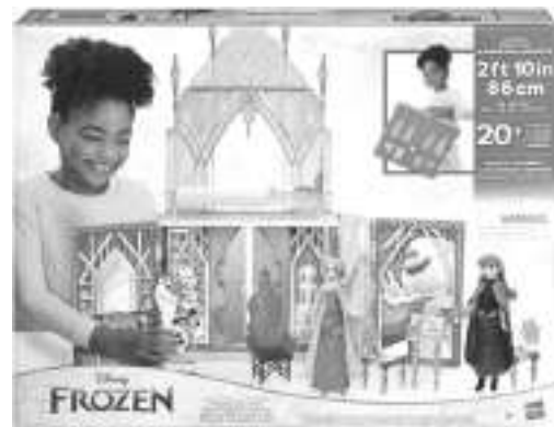
Take frozen fun on the go with Disney's Frozen 2 Elsa's Fold & Go Ice Palace Playset.