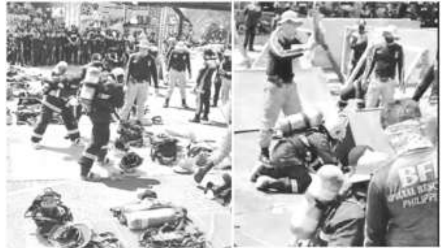
BFPNCR SKILLS OLYMPICS 2022 – Teams of firefighter from the Bureau of Fire Protection National Capital Region's five district commands compete with each other to bag the overall championship in the recently concluded BFPNCR Skills Olympics held at BFPNCR Grounds in Cubao, Quezon City. The first of a kind "all woman" competition was conceptualized to test the operational skills and competence of lady firefighters. The event is also the command's support and recognition to Women's Month 2022 Celebration this month of March, coinciding the Fire Prevention Month observance.

eryone, particularly women to believe in themselves and build self-confidence. "Believe in yourself first before others will," she said as she narrates her per-