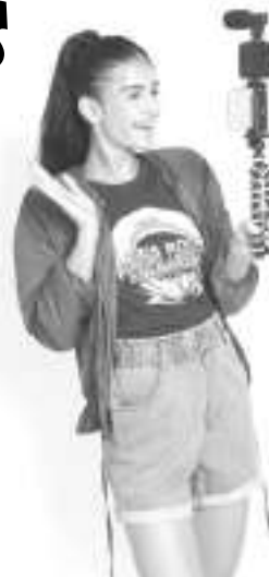
Athleisure blues. Denim shorts with a statement tee and parka jacket.