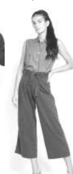
Denim on denim. Blue culottes and a sleeveless top.