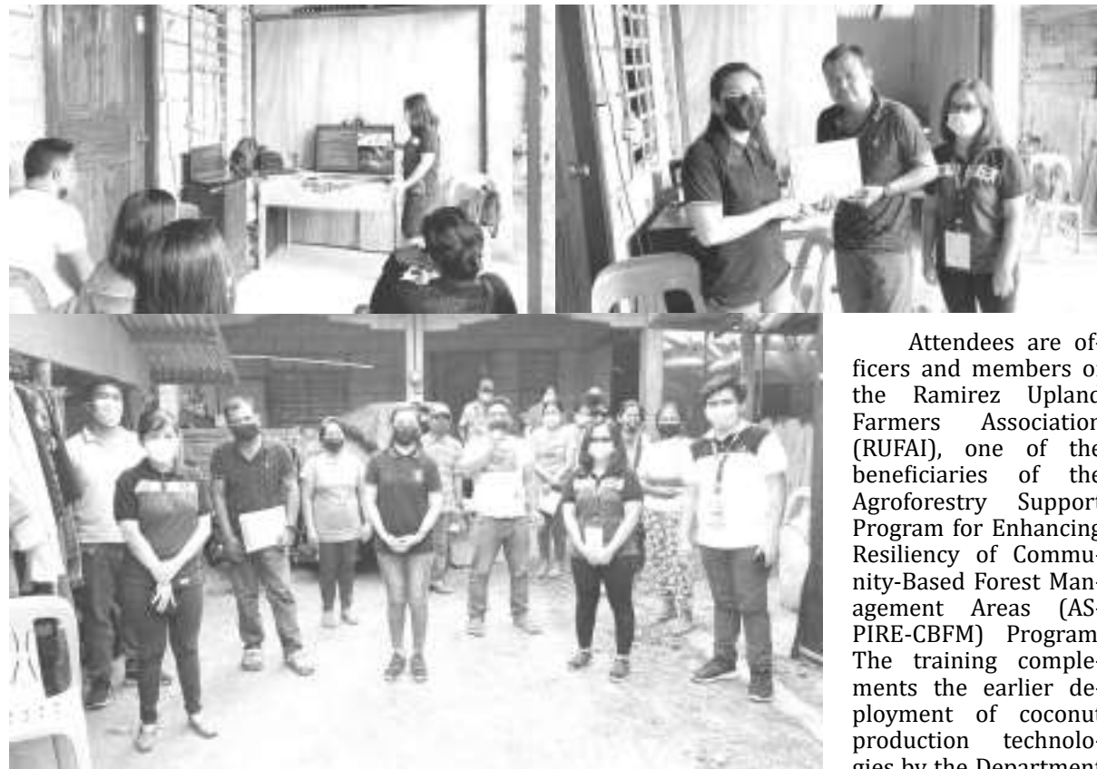
Coconut farmers in Brgy. Ramirez, Magallanes, Cavite underwent a training on food safety last 21 January 2022.

nization in support of their livelihood.