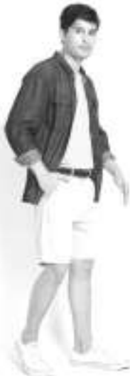
Plain tee and shorts layered with black denim top