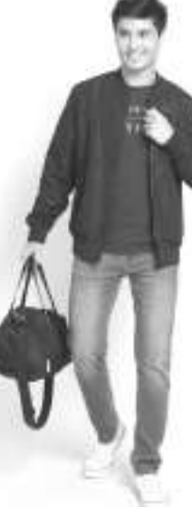
Light frayed jeans, a casual tee and bomber jacket for an edgy look.