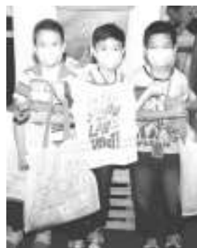
These children joyfully receive bags full of clothes and shoes from SM shoppers.