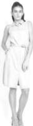
Denim dress with a utilitarian vibe