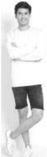
Blue denim + white = preppie appeal