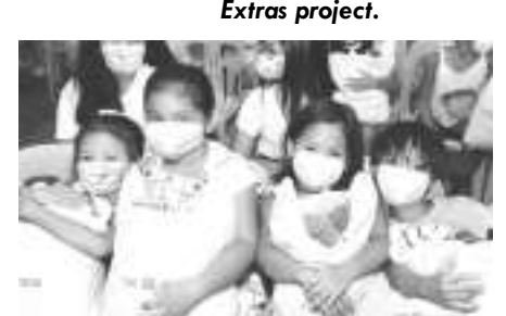
These kids from San Bartolome De Novaliches Parish were one of the beneficiaries of the Share Your Extras campaign.