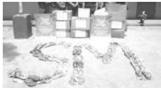
Make a difference by sharing your slippers and clothes in The SM Store and SM Foundation's Share Your Extras campaign.

Sharing is not just about donating, it is about making a difference in the lives of the less fortunate. Come and Share Your Extras at all branches of The SM Store! (KCHT)