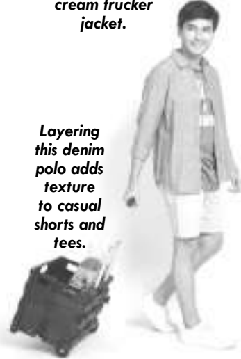
Layering this denim polo adds texture to casual shorts and tees.

• Love that layering! Denim pieces – chambray tops, jackets, jeans, skirts, and shorts – are so versatile they can be mixed with other fabrics, silhouettes, and textures.