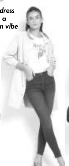
Skinny jeans worn with a casual tee and parka jacket.