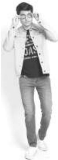
Lights faded jeans go well with a dark top and cream trucker jacket.