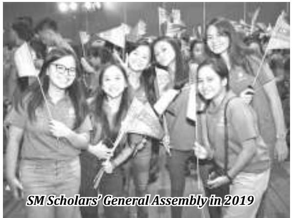
SM Scholars' General Assembly in 2019

SM Foundation (SMFI) invites incoming college freshmen to apply for the SM College Scholarship program for School Year 2022-2023 via its online application portal from January 15 to March 15, 2022.