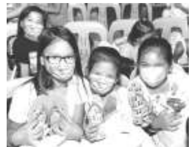
These girls happily display their brand-new slippers from The SM Store courtesy of Share Your Extras project.