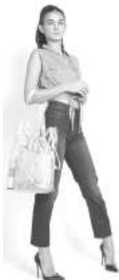
Go tonal by mixing light and dark denim shades