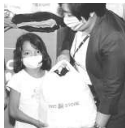
SM shoppers can drop off their slightly used or brand new clothes until February 15 in all The SM Stores in Metro Manila and from February 1 to 28 in the rest of the stores nationwide.