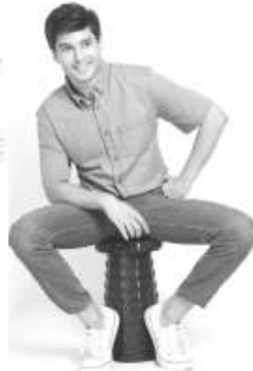
Classic meets cool. Skinny jeans worn with a washed chambray shirt.

Living in the new normal made us narrow down our lifestyle to what seems to be essential. And in the world fashion-denim is essential.