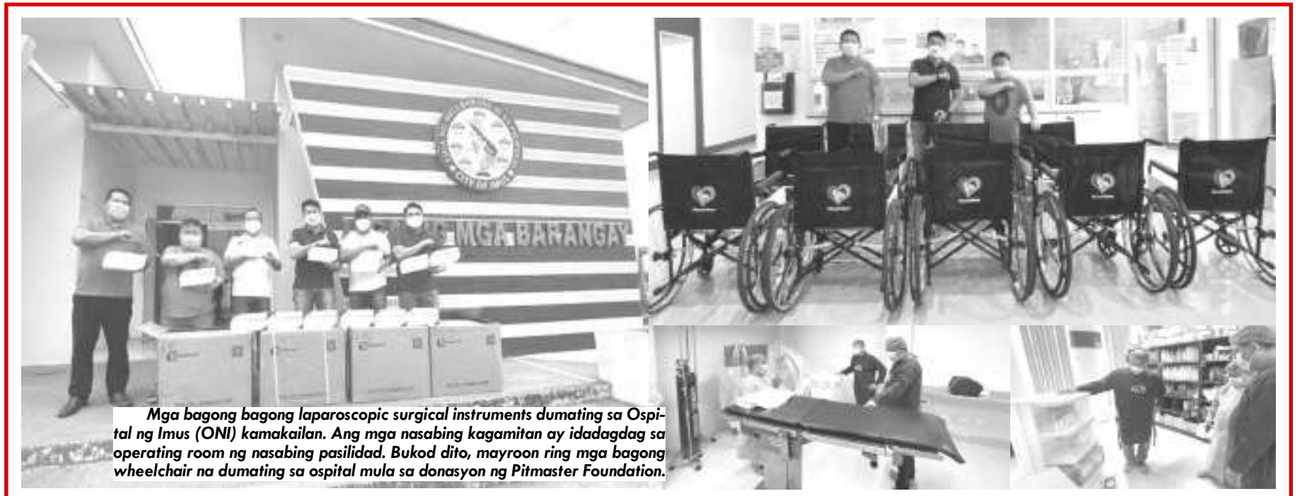
Mga bagong bagong laparoscopic surgical instruments dumating sa Ospital ng Imus (ONI) kamakailan. Ang mga nasabing kagamitan ay idadagdag sa operating room ng nasabing pasilidad. Bukod dito, mayroon ring mga bagong wheelchair na dumating sa ospital mula sa donasyon ng Pitmaster Foundation.