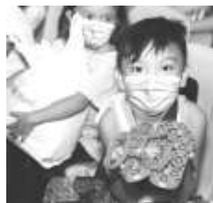
This young boy from San Bartolome De Novaliches Parish is happy to receive this new pair of slippers