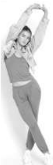
Cozy and chill denim trucker jacket.