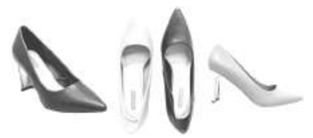
These Bata Ladies Vella Red Label Pointed Heels are designed to carry you in comfort with synthetic upper material, high-heels that highlight your femininity, and a comfortable insole which distributes weight perfectly.

Aside from footwear and shoes, Bata also offers accessories such as wide selection of bags,