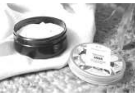
The Body Shop's extra nourishing Argan Body Butter is a cult favorite. Enriched with precious argan oil, it has a warm and creamy scent with a hint of the exotic.

Let's not break the cycle. We encourage our THE BODY