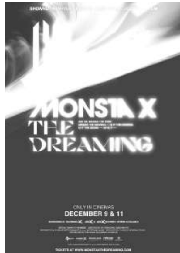
Monsta X: The Dreaming, an SM Cinema Exclusive, shows this December 9 & 11. As a gift to their fandom, this brand-new film gives an intimate look at the South Korean boy group's rigorous journey over the past six years including exclusive one-on-one interviews with each individual member, personal stories from their time in America, and a special concert clip exclusively for MONBEBE.