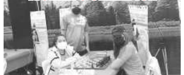
Isang Dasmareño ang nakapag-uwi ng 2nd place sa katatapos lamang na 2021 Philippine National Chess Women's Championships, na ginanap na (cont. p.3)