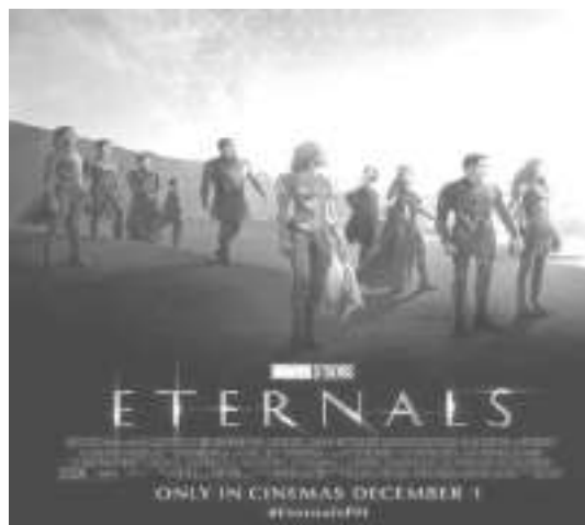
Starring Angelina Jolie, Richard Madden, and Salma Hayek, Eternals features an exciting team of Super Heroes in the Marvel Cinematic Universe, ancient aliens who have been living on Earth in secret, who reunite to battle the evil Deviants. Now showing at SM Cinemas.