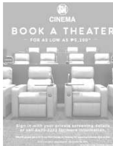
Get your own exclusive movie space with the current movies you like with SM Cinema's Book-a-Theater. Reserve an exclusive cinema perfect for a private movie screening by treating your family and friends to a truly movie theatre experience.

remains committed to the safety and wellbeing of their mallgoers that's why all SM Cinemas are certified safe with Safety Seals awarded by its local government. SM Cinema, in partnership with Hygiea Innovations and Technology, Inc, have installed MERV filters and air purifiers to ensure safe and clean cinema for everyone. A