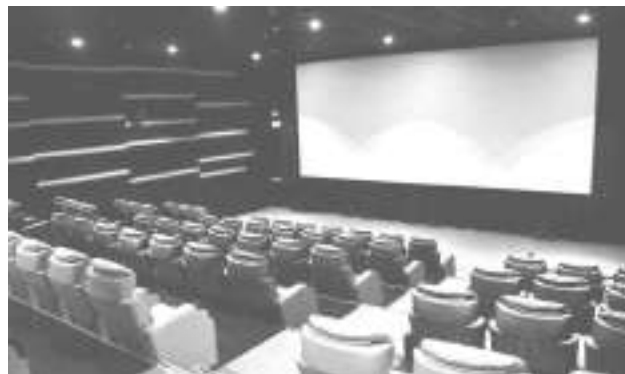
Experience a grand way of watching movies at SM City Grand Central with four state of the art regular cinemas and 2 Director's Club equipped with Surround 7.1 sound, a laser projection system and 88 premium gliding seating capacity.