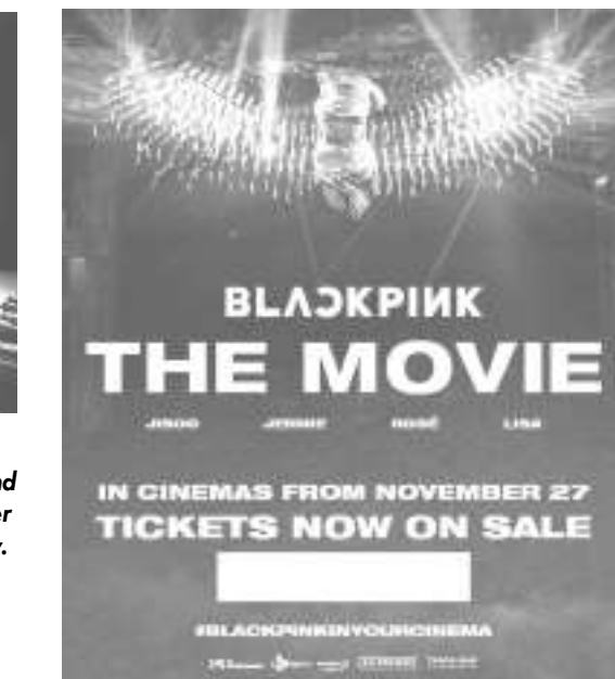
An SM Cinema exclusive, Blackpink the Movie celebrates the 5th anniversary of the beloved K-pop girl group. Now showing at selected SM Cinemas, it is also a special gift for "BLINKs" - BLACKPINK's beloved fandom - to revisit old memories and enjoy the passionate performances in the festive spirit.

SM Cinema also has exclusives that will surely delight K-Pop fans. Blackpink, the Movie celebrates the 5th anniversary of the beloved K-pop girl group. It is also a special gift for BLINKS - Blackpink's beloved fandom - to revisit old