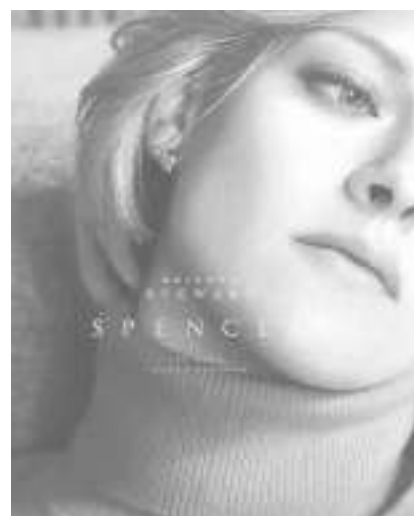
Spencer is a 2021 historical fiction psychological drama film directed by Pablo Larrain and written by Steven Knight that showcases the marriage between Princess Diana and Prince Charles.