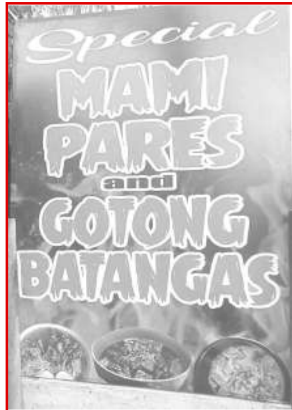
Loc. at National H,way Brgy. Macabling Sta. Rosa Laguna