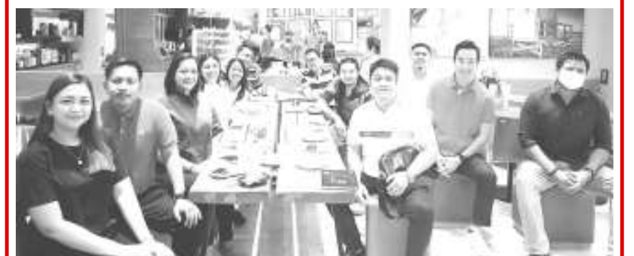
Ready for real change Mga Ka LB? These are the men and women behind the progress and change that is about to happen in our town in the coming months. A quick coffee date to discuss the programs and projects for a Bagong Los Baños with the Sanggunian Bayan.