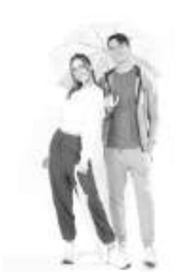
Nice and cozy ladies' cotton crop top pullover and men's jacket with hood. All available at Surplus.