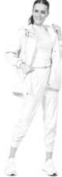
Jaunty jacket with hood from Surplus.