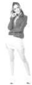
Denim Daze. Blue wash full buttoned denim jacket for ladies. Available at Surplus.