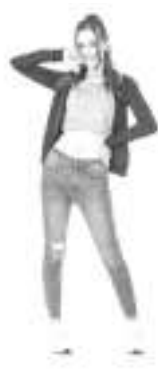
Zip up in style with Surplus' fully zipped jacket with hood.