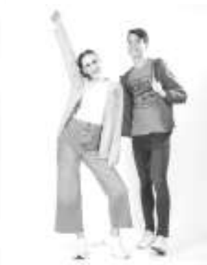
Keep warm, safe, and dry with this hooded raincoat jacket active zip wind breaker jacket