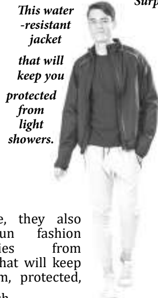
This water-resistant jacket that will keep you protected from light showers.