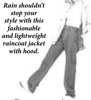
Rain shouldn't stop your style with this fashionable and lightweight raincoat jacket with hood.