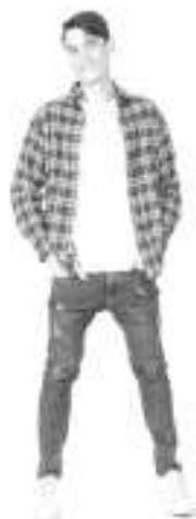
Go casual and preppy on rainy days with this checked long sleeved top from Surplus

for some, they also open fun fashion possibilities from Surplus that will keep you warm, protected, and stylish.