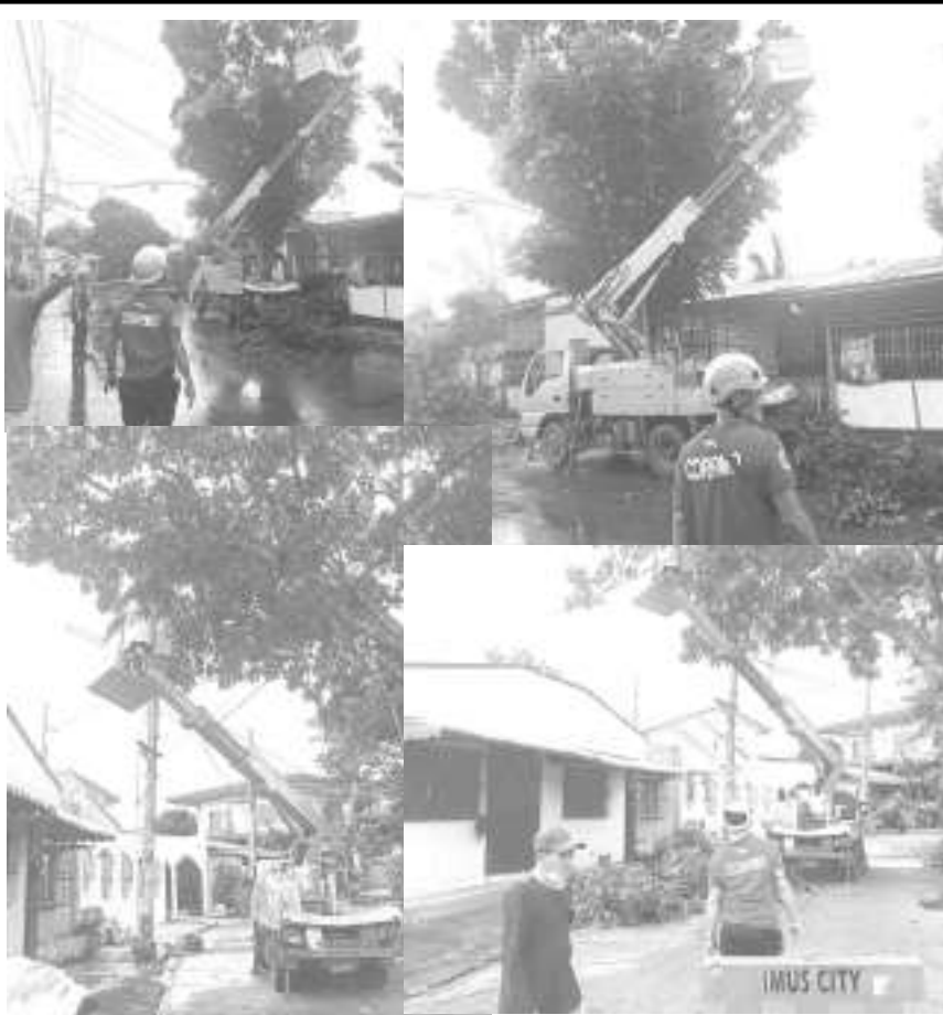
Sa pakikipagtulungan ng City Engineering Office at City Disaster Risk Reduction and Management Office (CDRRMO), pinutol kahapon, Agosto 23, ang sanga ng mga puno na maaaring magdulot ng panganib sa mamamayan.

Bahagi ito ng paghahanda ng Pamahalaang Lungsod ng Imus sa banta ng Bagyong Florita.