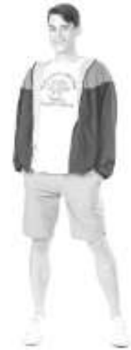
This reversible hooded jacket will give you two rainy day looks.