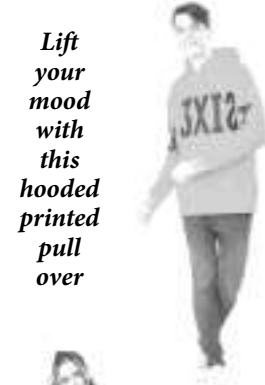
Lift your mood with this hooded printed pull over