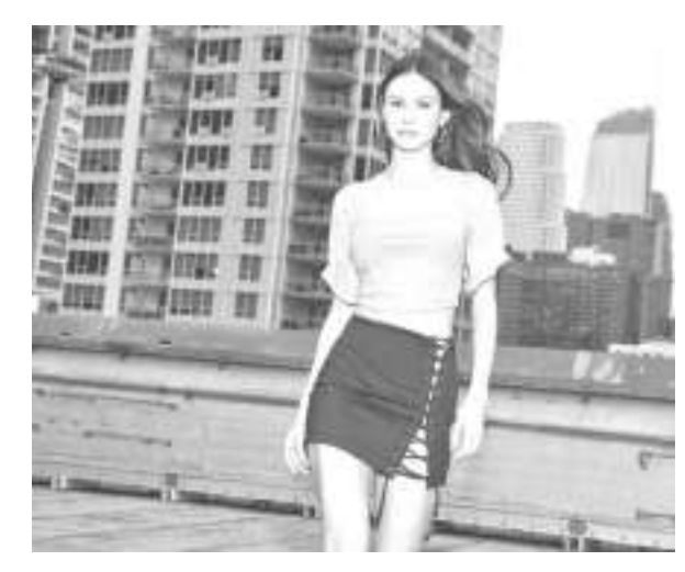
Sofia Style: casual and trendy bustier cropped top paired with a lace-up mini skirt from F21.

hello again to teachers, classmates, and friends in the classroom and on-campus.