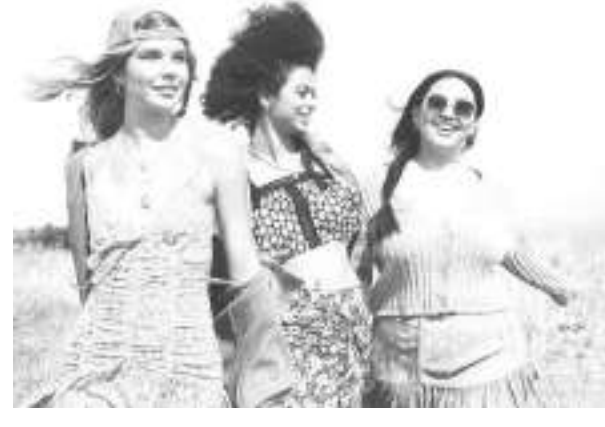
Pretty and preppy. Cropped cardigan sweater, floral print cropped top and skirt, ruched floral print mini dress, hoop earrings and round- frame sunglasses.

classes, back after two years of virtual learning, it's time to say