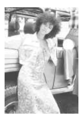
Everything Elle. Wear a cropped denim jacket with a floral print midi dress for a cool and relaxed day in school. Available at Forever 21.

It's also time to say hello to dressing up again, and new clothes for come back-