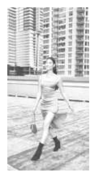
Belle of the ball. F21's satin midi dress with o-ring faux leather shoulder bag.