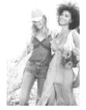
Romantic, bohemian, and forever feminine. Forever 21's satin lace trim-cami, distressed flare jeans, plaid button-up shacket, cami midi dress and crochet vest.