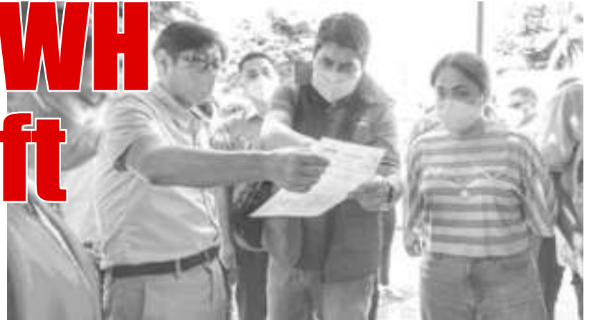
President Ferdinand Marcos Jr. (2nd from left) reads the situational briefing during his visit to Abra province on Thursday (July 28, 2022). The province is under a state of calamity following a magnitude 7 earthquake.

MANILA - President Ferdinand "Bongbong" Marcos Jr. on Thursday instructed the Department of Public Works and Highways (DPWH) to prioritize the inspection of hospitals and health care facilities in Abra following the magnitude 7 earthquake that jolted the province. "Do the inspections first of the public buildings. I think your priority will be quite right is the hospital,