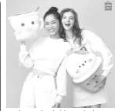
To hug and to hold. Lovely beverages pillow plushies available at Miniso.

The Miniso Wink Rewards Card which only costs P200 can be used to earn points on all merchandise purchases and redeem points for in-store credit. Customers must present their