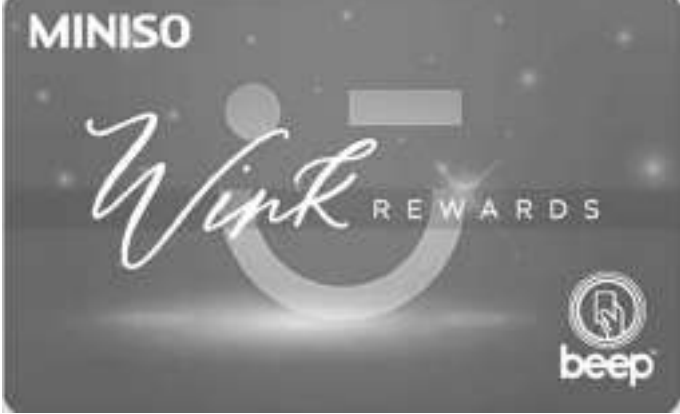
Shop and earn exciting perks and rewards with the Miniso Wink Rewards Card.

lifeapanese retailer stvle Miniso recently launched its Miniso Wink Rewards Card loyalty programwith lots of exciting perks and rewards. Now, there's more reason to check out and shop for Miniso's fun and fashionable finds.