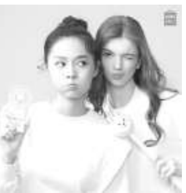
So many lovely items and giftables you can choose from when you visit Miniso.

Miniso Wink Rewards Card! For more details, visit Miniso in-store or online via shop.minisoph. com or follow Miniso Philippines in Facebook and Miniso PH in Instagram.(KCHT)