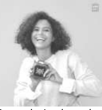
Get rewards points when you shop for this handy and trendy fashion speaker at Miniso.

= P1.) The Wink Rewards Card can only be