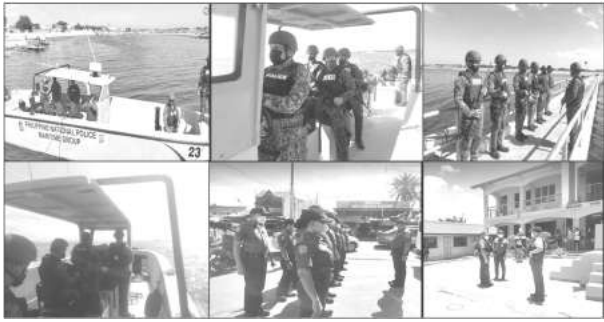
tagumpay ng National and Local Elections

Cavite Maritime Police Station ay mahigpit na pakikipag-ugnayan sa ibang ahensyang nagpapatupad ng batas na may kaugnayan rito, at nagbibigay ng mga suportang administratibo, logistikal at seguridad upang matiyak ang maayos, mapayapa at may kridibilidad na halalan; at para sa ligtas at maayos na paghahatid ng mga kagamitan katulad ng ballot forms, suplay at iba pang kagamitan pang halalan kabilang ang seguridad ng mga transmission line tower ng National Grid Corporation of the Philippines na mahalaga para sa