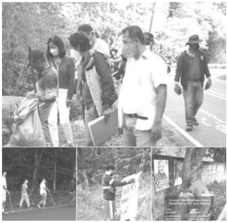
up activity in Ternate en during the conduct of

Operation baklas poster started March 08,