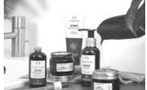
Boost your skin defense mechanism with The Body Shop's new and improvedEdelweiss skinare range that has been reformulated to deliver double the concentration of Edelweiss. This includes Edelweiss Cleansing Concentrate, Daily Serum Concentrate, Intense Smoothing Cream Intense Smoothing Day Cream and Liquid Peel.

Made within strict 'green chemistry' principles, Edelweiss is organically farmed and responsibly harvested by hand by The Body Shop's trusted supplier. It is carefully and respectfully cultivated in areas where the flower is not endangered to respect the Alpine biodiversity. It is then extracted using zero chemical waste, first through drying the plant, and then distilled using a renewable process.