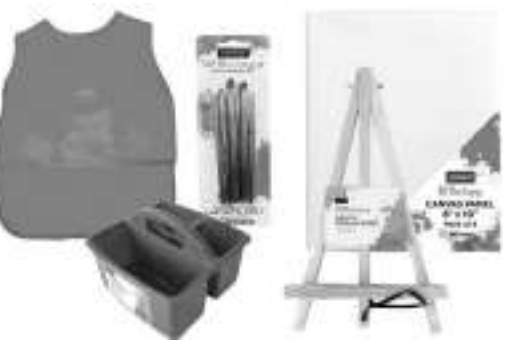
The Artherapy Artist Bundle includes a Canvas Panel, a tabletop Easel, Artist Brush Set, an art caddy and an apron.