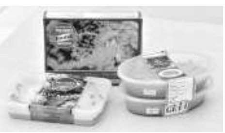
Don Juan Filipino Delicacies bestsellers Inutak, blueberry graham de leche and leche flan