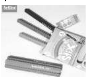
Draw with delight with the fine brush nib of the Artline Colouring Marker Stix.