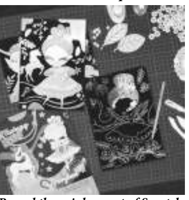
Reveal the rainbow art of Scratch Magic with a wooden stylus.