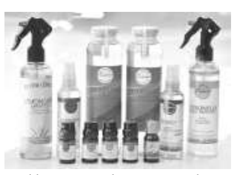
Gold in Grass products are non-solvent, single origin and vegan.