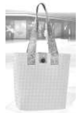
Stylish yellow bayongbag with intricately designed straps fromDa Buena's Handicrafts