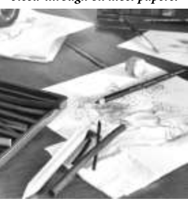
Go for Sustainable art toolslike this Faber Castell eco pencil Pitt natural charcoal pencil.