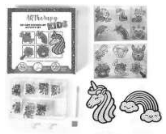
Artherapy DIY GEM Sticker Art Activity Set