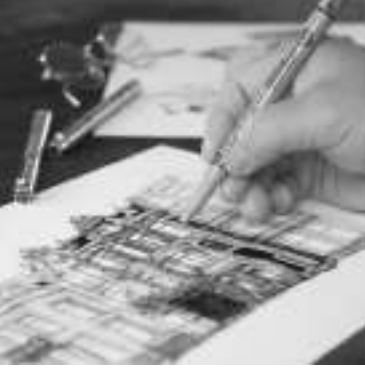
Sakura Micron Pigma is the Go-To fineliner pen that is smooth, crisp, rich ink colors and won't smear or bleed-through on most papers.

The event will be held along the Macapagal Boulevard in Pasay City where hundreds of thousands of her supporters are expected to attend.