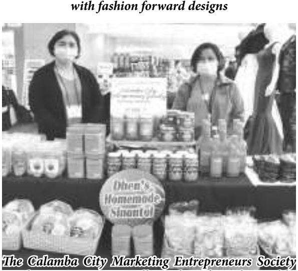
Marketing Cooperative sells products from the city like okoy, sukang tuba, sinantol and other local products