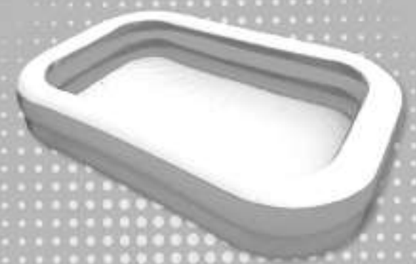
Summerize your backyard with this Giant Rectangular Pool.

or Waterslide with Gator sprinkler pool.