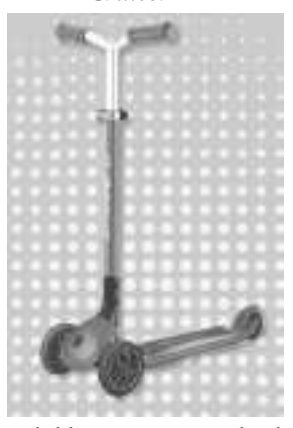
Globber Master 3-Wheel foldable scooter.