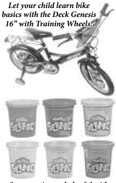
Stay creative and playful with

to discover outdoor fun come next. With eased restrictions, this is the best time for kids to enjoy and explore the great outdoors. They make a splash in your own backyard with cool inflatable pools, floaters and bubble blasters. Create your own exciting water adventure with a Giant rectangular pool