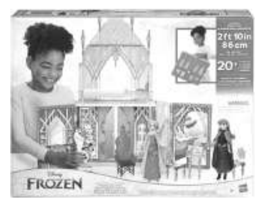
Take frozen fun on the go with Disney's Frozen 2 Elsa's Fold & Go Ice Palace Playset.

to discover outdoor fun come next. With eased restrictions, this is the best time for kids to enjoy and explore the great outdoors. They make a splash in your own backyard with cool inflatable pools, floaters and bubble blasters. Create your own exciting water adventure with a Giant rectangular pool