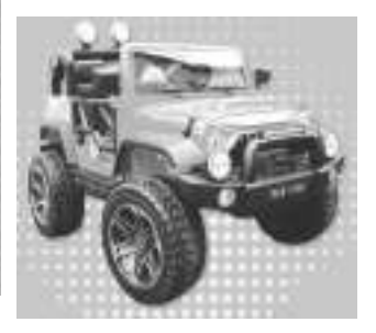
Rux Motorized Off-Road Cruiser