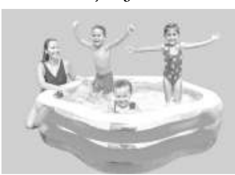
Enjoy a summer splash with the family with this Intex Summer Color Pool.