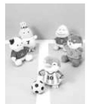
Surprise someone with Miniso's MINI Family Sports Blind Bag Collection

The Miniso x MINI Family Sports Series features functional yet playful items that will get you fit-spired. These include gadget accessories such as desk and mouse pads in Team Red and Team Blue designs; as well as wireless speakers with night lights for your cool