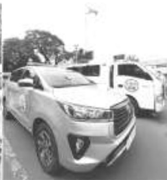
ly. The fund used for the purchase of the vehicles came from the 20 percent fire code fees collection share of the local government unit. Calixto and Cante are shown on left photo during the turnover rite.