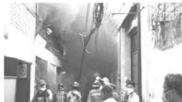
Smoke billowing up from the burning residential units in Harrison Figueroa, Barangay 70, Pasay City. From January 1 to February 15 period this year, the Fire Bureau has already recorded more than 1,500 fire incidents nationwide.

First-aid demonstration on cardiopulmonary resuscitation