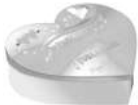
Say it sweetly with this Toblerone Heart-shaped box.