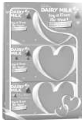
It's Love 2.0 with Cadbury's special emoji and cool stickers in its "Say it From the Heart" bundle.

It is said that the Cadbury group introduced a new Valentine's Day tradition when candy maker Richard Cadbury was inspired to package chocolates in heart shaped boxes decorated with rosebuds and cupids, which were popular symbols of romance among the Victorians. These boxes had locks where one could later store mentoslike love letters and small gifts.