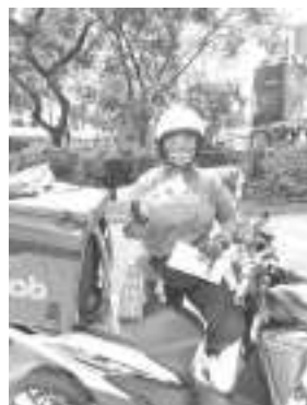
700 Grab Riders felt your love over the holidays as they received their Goldilocks Bitbit Pack from The Body Shop Call to Deliver orders.

Shop in-store online and celebrate Valentine's Day with SM Snack Exchange, visit https://www.thesmstore.com/collections/snack-exchange or order via The SM Store Call to Deliver services at #143SM (#14376) and have a personal shopper assist you. For more updates and exciting deals, follow The SM Store Snack Exchange or checkout their online Catalog in Viber.(KCHT)