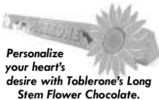
Personalize your heart's desire with Toblerone's Long Stem Flower Chocolate.