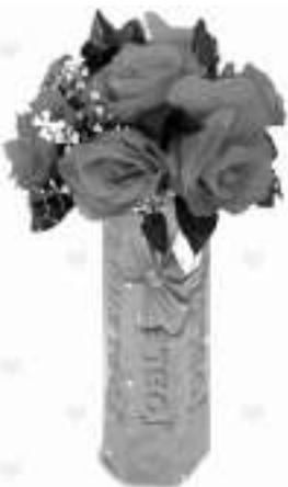
Get this free Rose Bouquet Topper for every 6 pieces of 100g Toblerone Milk bars purchased at The SM Store Snack Exchange.