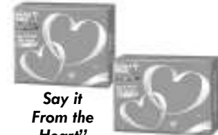
Say it From the Heart with Cadbury's Roast Almonds and Fruit & Nut gift boxes.