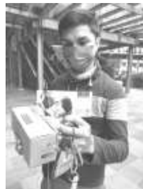
Grab riders received the love from The Body Shop purchase you made via Call to Deliver over the holidays.

Body Butters amounting to Php 1,275,000 were given to medical front liners from 14 partner hospitals.