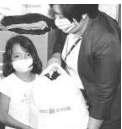
SM shoppers can drop off their slightly used or brand new clothes until February 15 in all The SM Stores in Metro Manila and from February 1 to 28 in the rest of the stores nationwide.