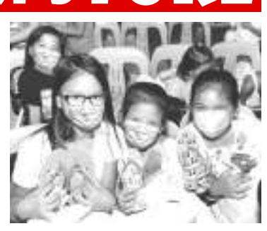
These girls happily display their brand -new slippers from The SM Store courtesy of Share Your Extras project.