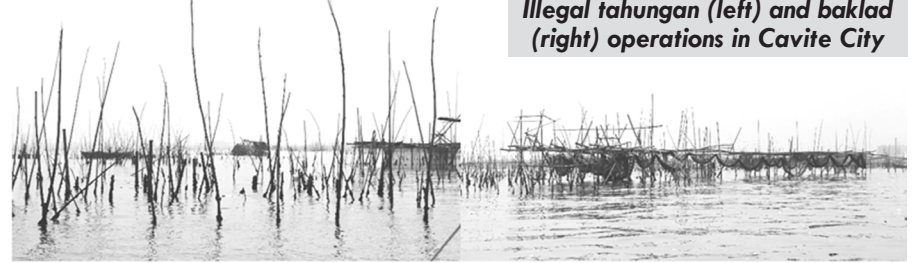
Illegal tahungan (left) and baklad (right) operations in Cavite City

Led by the Department of Environment and Natural Resources (DENR) CALABARZON and the Provincial Environment and Natural Resources Office (PENRO) of Cavite, the marking of the illegal fish cages, fish pens, baklads, sapras, and tahungan within Cavite City, Kawit and Noveleta, Cavite for demolition commenced on September 15, 2021.