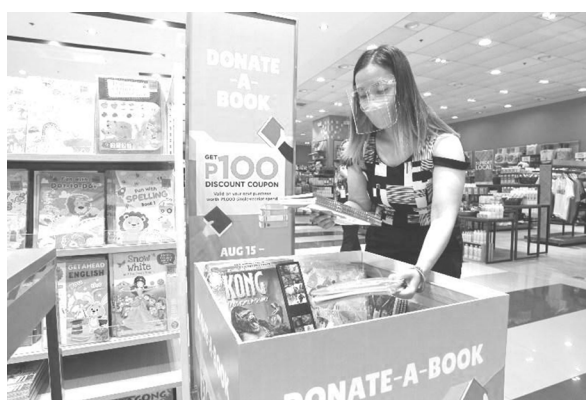
New and gently used pre-loved books in all kinds are all welcome. Shoppers can also donate and match with Learning is Fun (LIF) books, as well as SM Stationery section's learning materials, and in exchange, shoppers will receive 100 pesos discount coupon for every donation made.