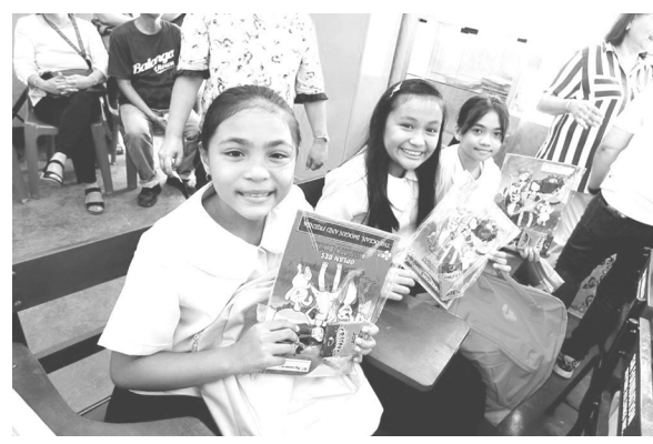
These girls from Balanga Elementary School happily and excitedly show their brand new sets of school supplies courtesy of The SM Store's Donate-a-Book campaign.