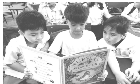
Kids from Balanga Elementary school are very happy to receive books donated by The SM Store during the recent Donate-a-Book campaign turn-over ceremony, held last 2019 in Balanga, Bataan.

S M shoppers can continue to share the joys of learning with children who need them most through The SM Store's Donate a Book campaign, which is now ongoing at select branches nationwide until September 30, 2021.