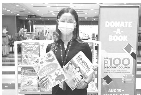
Shoppers can share the gift of knowledge with less fortunate children through the Donate-a-Book campaign now ongoing at selected SM Stores nationwide until September 30.