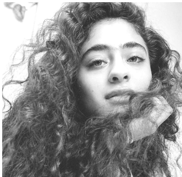
The Body Shop's new vegan routines - the Tea Tree and Moringa Haircare range.

The Body Shop's new haircare bottles and tubs are made from 100% recycled plastic, including Community Fair Trade recycled