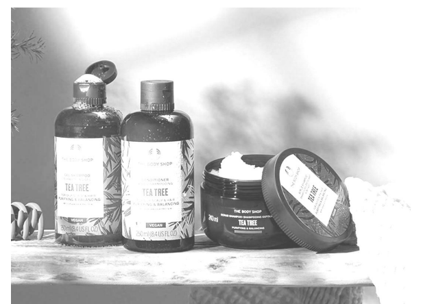
The Body Shop's new vegan Tea Tree haircare line purifies and balances oily hair and scalp made with organically-grown Community Fair Trade tea tree oil from Kenya and Vegan Silk Protein. Bottles and tubs are made from 100% recycled plastic.

at www.thebodyshop.com . The Body Shop's cruelty-free and vegan products are also available in The Body Shop stores, Call & Deliver, Lazada, Shopee and ShopSM. The Body Shop now accepts SM Advantage Card for points earning and redemption, SM and Sodexo premium pass in all The Body Shop stores