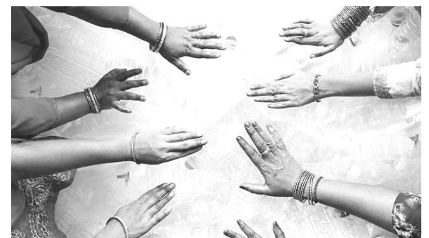
The Body Shop's new haircare bottles and tubs are made from 100% recycled plastic, including Community Fair Trade recycled plastic collected off the streets of Bengaluru, India. **Not including lids.