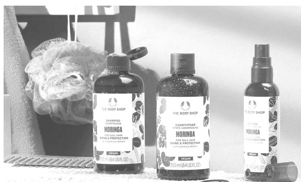
Brighten up your barnet with The Body Shop's new vegan Moringa Haircare routine that restores dull hair's radiance and shine, and protects hair from daily pollution. Made with Community Fair Trade moringa seed oil and extract from Rwanda and Vegan Silk Protein. Bottles and tubs are made from 100% recycled plastic.

plastic collected off the streets of Bengaluru, India.