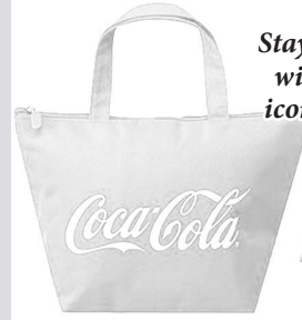
Stay Classy and vintage with this Coca-Cola's iconic red tote bag and cosmetic pouch.