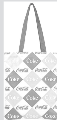
Shop at the nearest Miniso stores and get this Coca-Cola tote bag.

The collaboration between Japanese fashion brand Miniso with Coca-Cola brings a double dose of happiness, giving a new vitality to shopping with the fusion of young and classic brands.