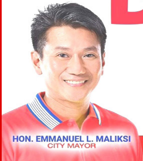
HON. EMMANUEL L. MALIKSI CITY MAYOR