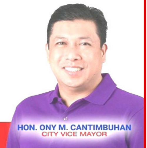
HON. ONY M. CANTIMBUHAN CITY VICE MAYOR