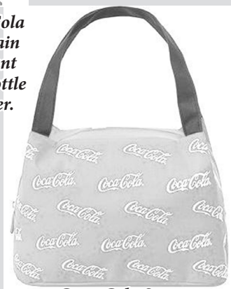
Coca-Cola Square Bento bag