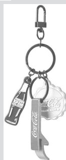
Coca-Cola Keychain Pendant with Bottle Opener.