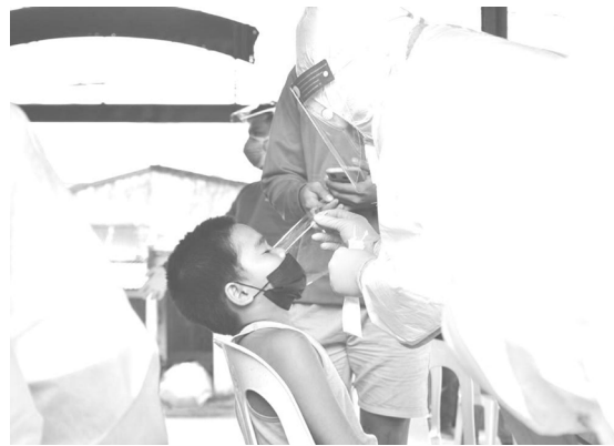
A young boy undergoes antigen testing during the conduct of "Project DELTA" led by DOH-CALABARZON officials and LGU health workers in Barangay Sta. Monica in San Pablo City, Laguna on July 30, 2021.

ter led the mass swab testing in the Province of Laguna from July 30, 2021 to August 13, 2021, particularly in Brgy. Sta. Monica in San Pablo City, Brgy. San Nicolas in the town of Bay, Brgy. Wawa in Lumban, Brgys. Barandal and Canlubang in Calamba City. A total of 343 individuals were tested.