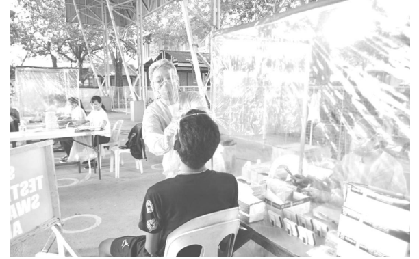
A resident of Brgy. Wawa in Lumban, Laguna submits to antigen testing during the conduct of Project "Detect Early Local Transmission through Antigen Testing" (DELTA) led by officials of DOH-CALABARZON and health workers of LGUs conducted on August 6, 2021

The Regional Epidemiology and Surveillance Unit (RESU) together with the Regional Infectious Disease Clus-