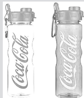
Take your refreshment on the go with this Coca-Cola Water Bottle.