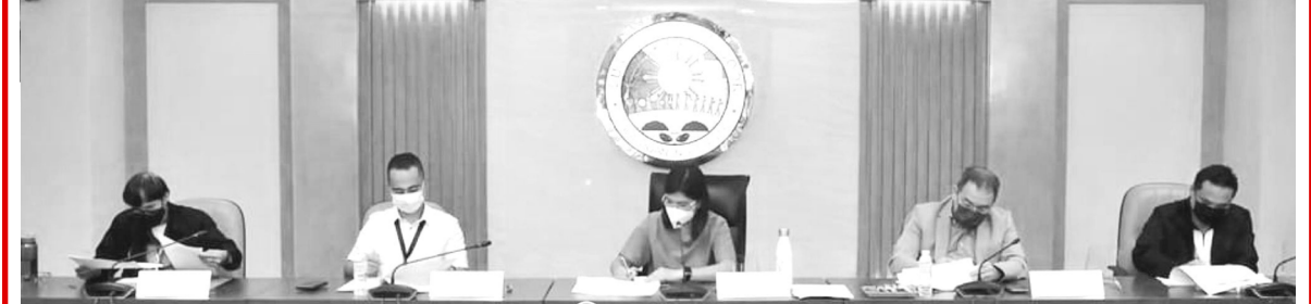
Pinangunahan ni Mayor Lani Mercado Revilla ang paglagda sa isang loan agreement sa gitna ng Pamahalaang Lungosd ng Bacoor at Development Bank of the Philippines para sa Crematorium - Columbarium Project ng Lungosd ng Bacoor.