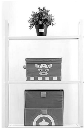
Captain America storage bins and two-tier drawer storage box.