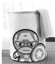
Captain America foldable basket organizer.