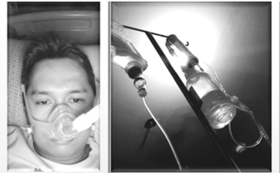
Kasama na sa isipin ang babayaran sa ospital, pero dahil sa benepisyo ng PhilHealth, agad mong mararamdaman ang financial risk protection.

Patuloy ang pagsisikap ng Pamahalaang Lungsod at ng Ospital ng Imus para mapaunlad ang serbisyong pangkalusugan para sa mga mamamayan.