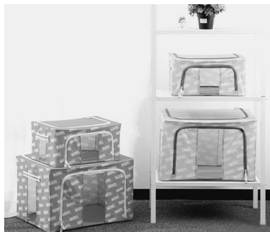
Marvel x Miniso wardrobe organizer bags are made of premium fabrics that are sturdy and stackable.