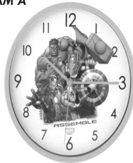
Marvel Avengers Assemble Wall Clock

Superhero fans will be happy to know that Japanese fast fashion brand Miniso has collaborated with Marvel, adding a touch of comic design and heroic style to everyday life. Better still, shoppers can enjoy up to 50% discounts on Marvel Home items at Miniso's Home and Living Sale, which is ongoing until May 02.