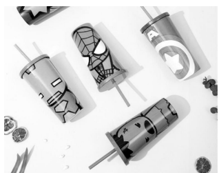
Enjoy summer coolers with Stainless Steel Tumbler with Straw.