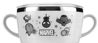
Stay healthy and snack like a hero with Round Bento Box with Anti-Scald Handles