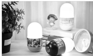
Let the Marvel Avengers light up your night with this rechargeable LED touch night light desk lamp.