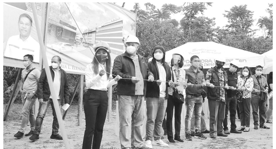
Department of Health -CALABARZON officials and local officials of Tagkawayan, Quezon lowers the time capsule during the groundbreaking ceremony of the proposed new buildings for the Maria L. Eleazar General Hospital in Tagkawayan, Quezon on January 14, 2021

SOUTHERN SPARKLE NEWS AND PUBLISHING publication is an English/Filipino Weekly Published every Monday at Region IV-A, Province of Cavite