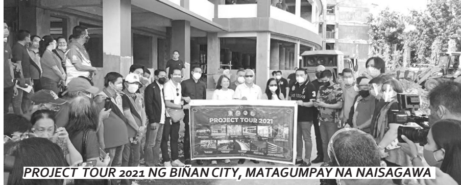
PROJECT TOUR 2021 NG BIÑAN CITY, MATAGUMPAY NA NAISAGAWA