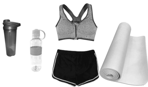
Black workout shorts + violet sports bra = elegance, energy, exercise