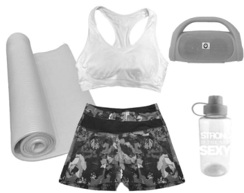
Jumpstart your routine in a white sports bra and printed shorts.