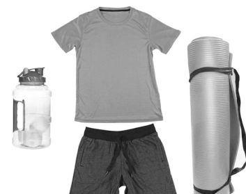
Fit and fab. A bold red top paired with some black shorts.