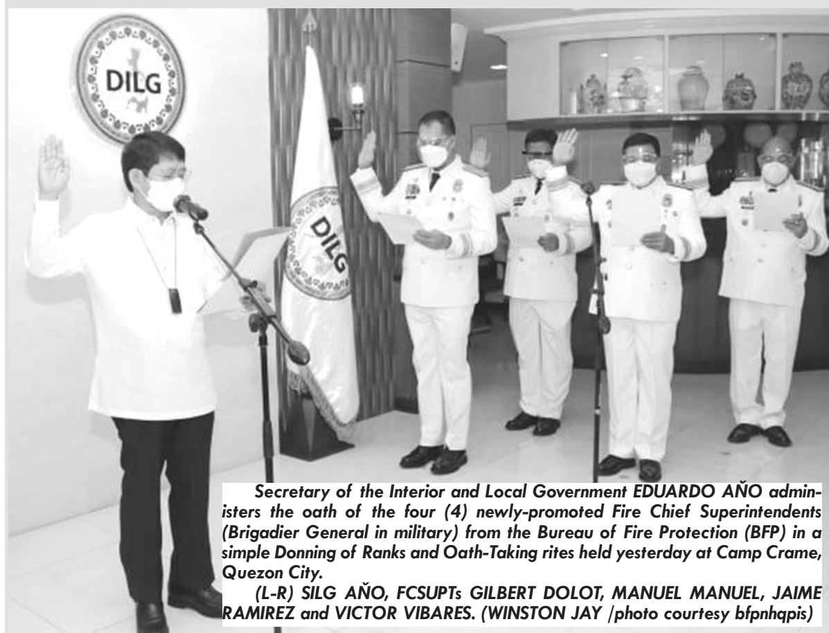
Secretary of the Interior and Local Government EDUARDO AÑO administers the oath of the four (4) newly-promoted Fire Chief Superintendents (Brigadier General in military) from the Bureau of Fire Protection (BFP) in a simple Donning of Ranks and Oath-Taking rites held yesterday at Camp Crame, Quezon City.