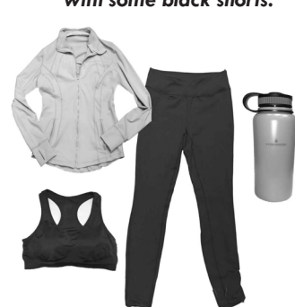
Add a pop of color to your usual black sports bra and black leggings with a workout jacket and tumbler in dusty rose.