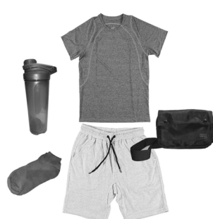
Head for the gym in a monochromatic look with a shaker bottle for your protein fix and a messenger bag for your important things.

Take good care of yourself and look fit and fab with the activewear collection of Surplus. The active collection, versatile