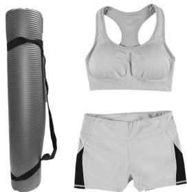
Sweat in style with a monochromatic look.