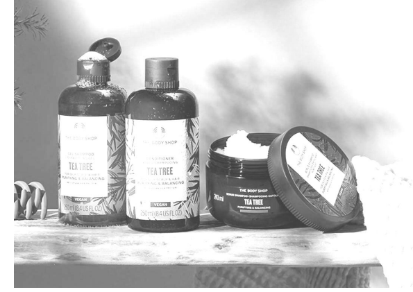
The Body Shop's new vegan Tea Tree haircare line purifies and balances oily hair and scalp made with organically-grown Community Fair Trade tea tree oil from Kenya and Vegan Silk Protein. Bottles and tubs are made from 100% recycled plastic.

at www.thebodyshop. The Body Shop's crueltyfree and vegan products are also available in The Body Shop stores, Call & Deliver, Lazada, Shopeeand ShopSM. The Body Shop now accepts SM Advantage Card for points earning and redemption, SM and Sodexo premium pass in all The Body Shop stores