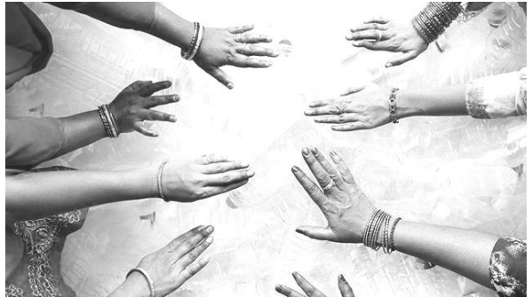
The Body Shop's new haircare bottles and tubs are made from 100% recycled plastic, including Community Fair Trade recycled plastic collected off the streets of Bengaluru, India. **Not including lids.