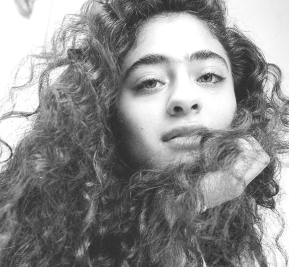
The Body Shop's new vegan routines - the Tea Tree and Moringa Haircare range.

The Body Shop's new haircare bottles and tubs are made from 100% recycled plastic, including Community Fair Trade recycled