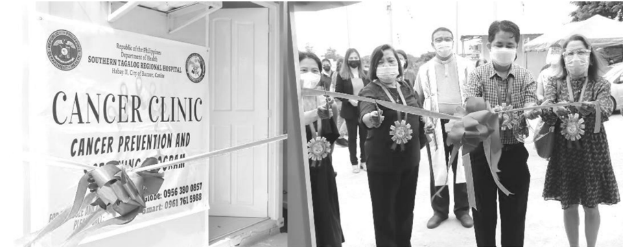
DOH-CALABARZON officials and provincial health officers of Cavite formally opens the Cancer Clinic at the Southern Tagalog Regional Hospital by cutting the ceremonial ribbon during the inauguration and blessing of additional new medical services held on August 6, 2021 in Bacoor, Cavite.

The newly opened health services were funded through the DOH HFEP (Health Facility