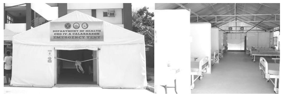
The 10-bed capacity emergency tent for Covid-19 patients installed in front of the Southern Tagalog Regional Hospital.

Enhancement Program) including the cancer clinic (with repair cost of P5,000), the animal bite treatment center (with repair cost of P20,000); the 10-bed capacity emergency tent amounting to P400,000 and the 10-bed capacity OB UHC WARD with P10 million fund from the Temporary Treatment Monitoring Facility (TTMF) project.