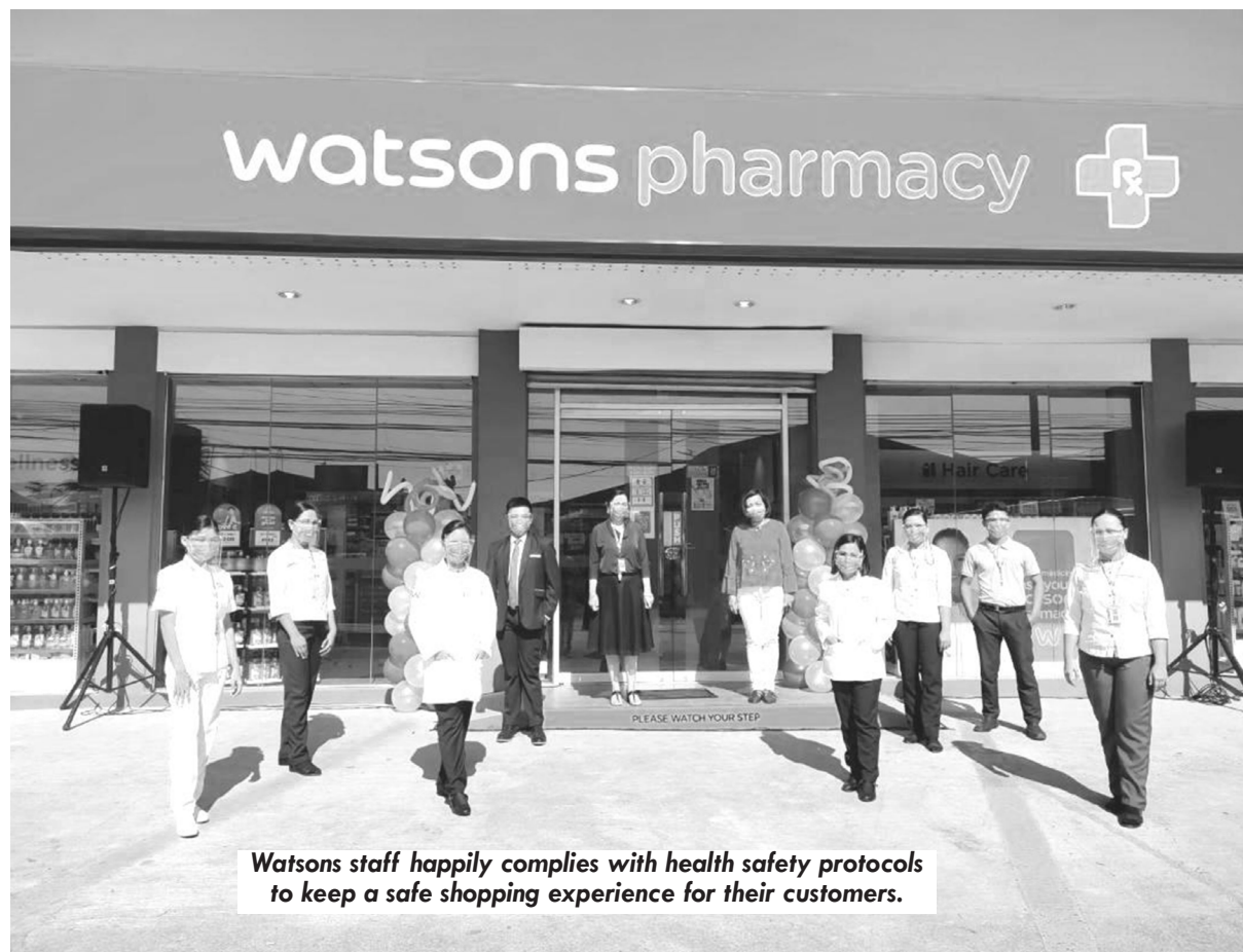
Watsons staff happily complies with health safety protocols to keep a safe shopping experience for their customers.

Watsons Philippines was recently named Retail Asia's Health and Beauty Retailer of the Year- Philippines at the recently concluded virtual 16th Retail Asia Awards 2021. The one-stop source for