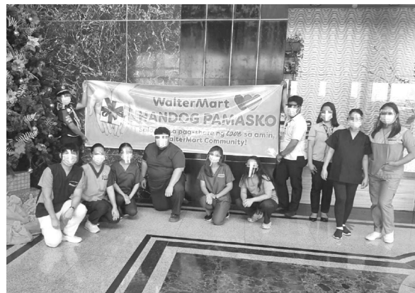
Gentri Medical Center and Hospital Inc. received Walmart's Handog Pamasko gift packs for their frontliners.