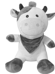
Let this cute ox plush toy from Toy Kingdom be your friend this Chinese New Year.