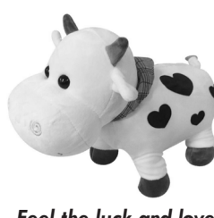
Feel the luck and love with this ox plush toy with heart shaped dots.

The Ox girl is a faithful mother's assistant – she loves cleanliness and order, loves cooking. Sweet in disposition she is trustworthy, and prefers to spend time for useful lessons instead of idle chatter. She is drawn to the world of art, and likes attending exhibitions and theatrical performances.