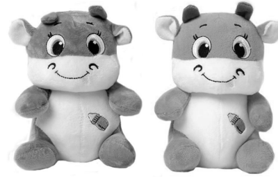
The ox girl is sweet in disposition just like these pastel colored stuffed toys.

Ox children are distinguished by their endurance and diligence. It seems that there are no obstacles for them. Silent and purposeful, they amaze us with their responsible approach to the smallest task.