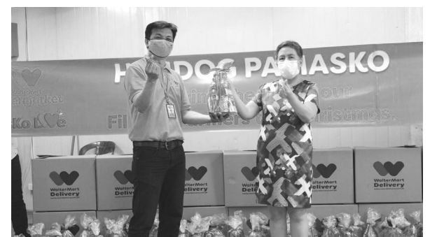
The Ateneo Center for Education (Tanging Yaman for Farmers) received Walmart donations of Handog Pamasko gift packs.

Check out the Handog Pamasko Thank you video link: http://bit.ly/2XaxjEz . For more updates, visit our facebook page @WalmartMallOfficial, @WalmartSupermarket or check our website at www.walmart.com.ph (KCHT)