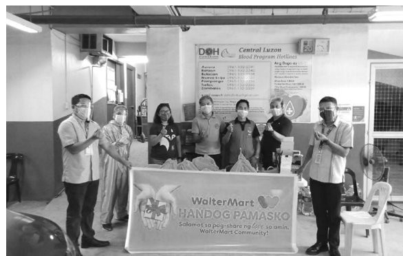
Walmart provides Handog Pamasko gift packs to medical frontliners of Bulacan Medical Mission Group Hospital (BMMG Hospital).