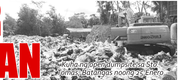
Kuha ng open dumpsite sa Sto. Tomas, Batangas noong 25 Enero

Ang Department of Environment and Natural Resources (DENR) CALABARZON ay magsisimula ng (cont. p.6)