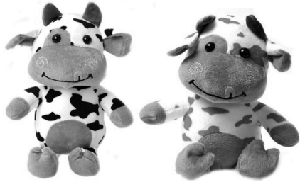
Welcome the Chinese New Year with lots of luck and fun with these speckled oxen inspired plushies from Toy Kingdom.

T he Ox, the second sign in the Chinese horoscope, is associated, with Water – a symbol of strength, reliability, and diligence. It is not surprising that children born in the Year of the Ox are from a young age aimed at success, and try to make their dreams come true.