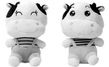
Ox boys like to play sports just like these cuddly toys in overalls from Toy Kingdom.