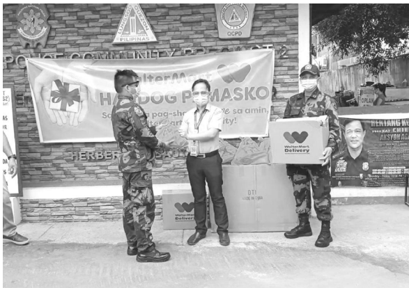
Walmart turns over its Handog Pamasko gift pack donations to the Philippine National Police (PNP) in Baler Station.