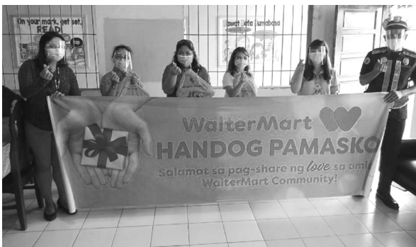
Plaridel Central School teachers were delighted to receive Walmart's Handog Pamasko gift packs.