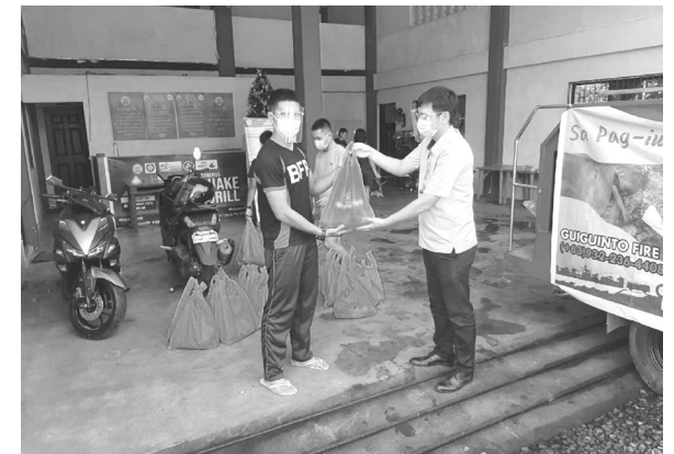
Walmart donated Handog Pamasko gift packs to Bureau of Fire Protection (BFP) of