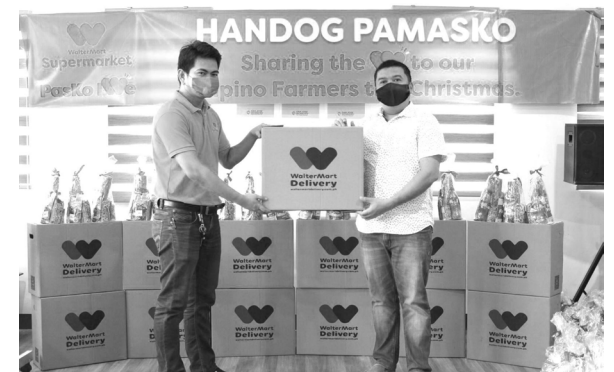
Walmart donations of Handog Pamasko gift packs to San Jose Farmers.

T rue to its commitment to be the friendly community hero, Walmart brings ultimate shopping convenience to customers every day in the new normal, as well as cheers to front-