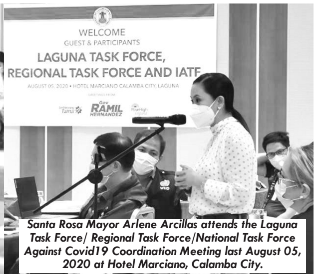
Santa Rosa Mayor Arlene Arcillas attends the Laguna Task Force/ Regional Task Force/National Task Force Against Covid19 Coordination Meeting last August 05, 2020 at Hotel Marciano, Calamba City.

Siniguro ng National Task Force (NTF) Against COVID-19 na bibisitahin nila ang ilang mga lungsod ng San Pedro, Santa Rosa, Biñan, Cabuyao at Calamba bilang ng naitalang kaso ng may COVID-19 kabilang sa mga lugar sa Laguna at Los Baños. Iyan ang napagang na rin dito ang San (cont. p.2)