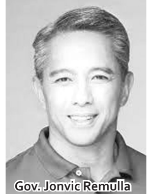
Gov. Jonvic Remulla

Despite the decision of the Palace regarding the quarantine status amid rising cases of the deadly virus, Remulla emphasized the need to