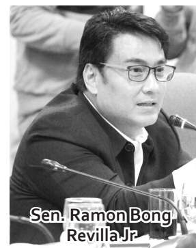
Sen. Ramon Bong Revilla Jr.

Senator Ramon Bong Revilla, Jr. appealed to the National Task Force (NTF) on COVID-19 regarding the new implementations set in regarding pillion riding beginning July