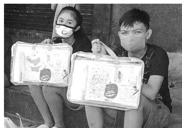
Kids receive their brand new school kits from SM Stationery as they wait for school opening and alternative programs.

Caritas Manila, the leading social arm of the Archdiocese of Manila, on the other hand, will use the donations to help its scholars, and sell the other donations in their Segunda Mana stores. The proceeds of the sale will be used to fund its projects to help not just students but also