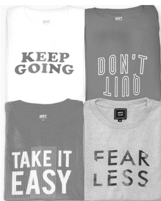
Inspo Statements Tee for dads.