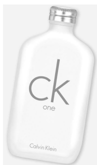
Calvin Klein Eau de Toilette