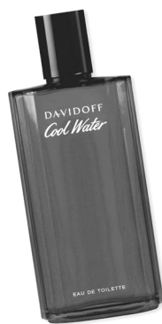
Davidoff Cool Water scent

Stay in the loop with latest #SMCallToDeliver updates, and join The SM Store Viber Community Group https://bit.ly/2XLYD0t .