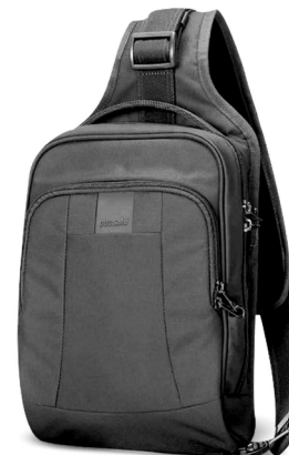
Keep your dad's gadgets secure and safe with this Pacsafe sling pack.