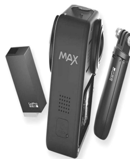
The GoPro Hero Max Action Camera is not only waterproof, but also lets you shoot footage in a 360-degree angle too.