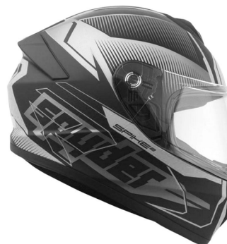
Keep your dad safe as he rides along with this Spyder, Spike Helmet.