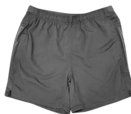
Dri-fit shorts for your dad's work out from home or home training sessions.