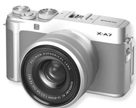
Dads will love this Fujifilm X-A7 Mirrorless Digital Camera that lets him shoot pro-level photos and videos.