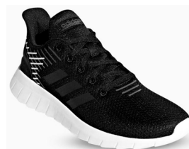
Adidas Rubber Shoes for your dad's fitness routine from home.