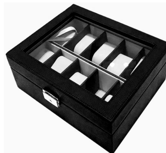
Sleek organizers for your dad's favorite watch collection.