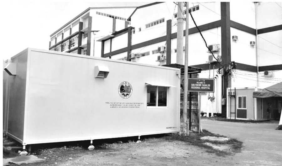
The container vans converted as modular temporary shelter by the local government of Bacoor, Cavite were turned-over to the Department of Health - CALABARZON to be handled and managed by the Southern Tagalog Regional Hospital.

able and confirmed COVID 19 cases will be confined here and will serve not only the community of Bacoor but also of neighboring municipalities of the province. This is also in preparation for the possibility of a surge