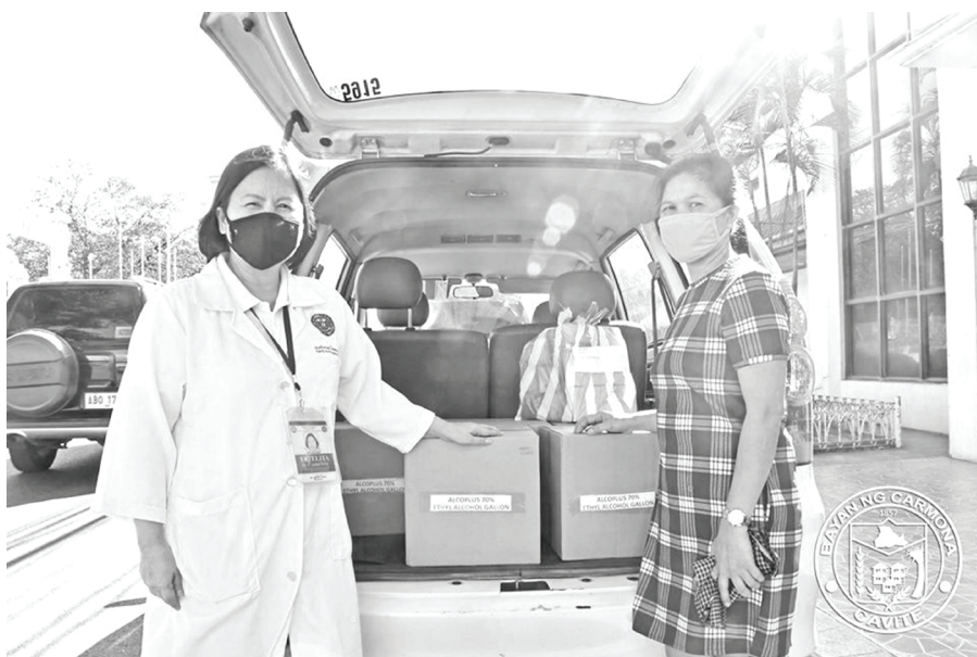
NGOs and companies continue to donate to Carmona frontliners. On May 4, 2020, non-government organizations and companies continue to help frontliners in Carmona through various donations such as boxes of face masks and alcohol.