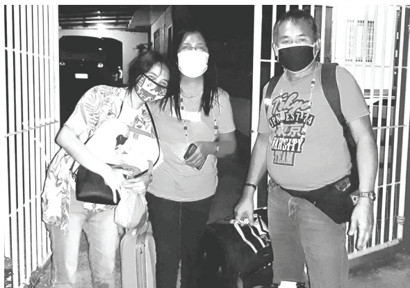
About 74 domestic tourists from the cities of Bacoor, Imus, Dasmariñas, General Trias and Trece Martires and the municipalities of Carmona and Silang stranded in the different cities and provinces in the country were flown in via domestic sweeper flights arranged by the Department of Tourism (DOT).

They arrived at the Ninoy Aquino International Airport (NAIA) on May 1 & 2, 2020 and were transported to their respective hometowns using the Cavite Provincial Government shuttle bus and LGU