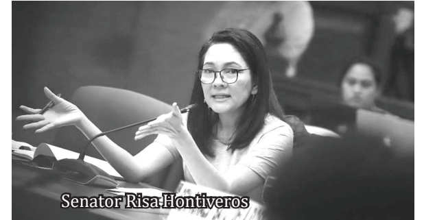
Senator Risa Hontiveros

The Senator said the Expanded Solo Parents Welfare Act or SB1411 is even more relevant now, given the amplification of unique hardships experienced by solo parents during the pandemic. She said balancing livelihood and childcare for solo parents