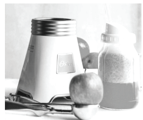
Juice up to boost your immune system with this handy Oster Mason Jar Blender. Available at thesmstore.com and ShopSM app.