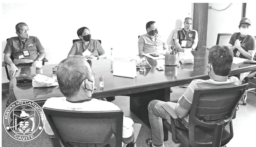
Carmona Mayor Roy Loyola conducts meeting with Barangay Captains. Municipal Mayor Roy Loyola held a meeting with Barangay Captains on May 4, 2020 to tackle the updates, plans, and actions for the community due to the extension of the enhanced community quarantine in the whole Luzon.