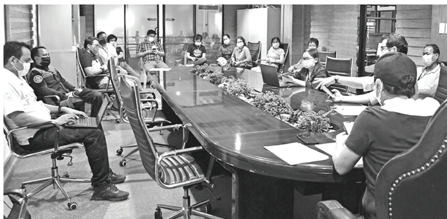
Carmona IATF on COVID-19 holds meeting about updates and future steps. The members of the Carmona Inter-Agency Task Force (IATF) on coronavirus disease (COVID-19) headed by Mayor Roy Loyola conducted a meeting on May 4, 2020 to discuss the updates and future steps of the local government against COVID-19. The IATF also discussed the recommendations regarding the "new normal" and other plans after May 15, 2020 which marks the end of the Luzon-wide extended enhanced community quarantine.