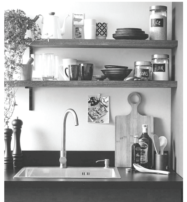
Make your kitchen workspace clutter-free and maximize the area by putting commonly-used utensils within your reach.

With most of us homebound these days, it's the best time to start good health habits by preparing nutritious meals for the family, and creating a wellness based lifestyle whose benefits we will enjoy beyond the quarantine. It's also the best time to rediscover the simple joys life and of doing things together.