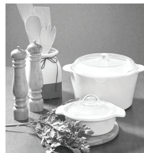
Prepare hearty meals with this bake dish known for its oven to table convenience.