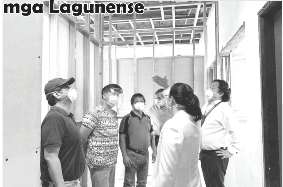
Nasa 70 porsyento patapos na ang Laguna Molecular Laboratory sa San Pablo City District Hospital na masisilbing COVID-19 testing center sa lalawigan ng Laguna.

L Inaasahang mapapabilis ang resulta ng coronavirus disease (COVID)-19 testing sa Laguna kapag natapos na at maging operasyonal ang binubuong Laguna Molecular Laboratory (LML) sa San Pablo City District Hospital (SPCDH).