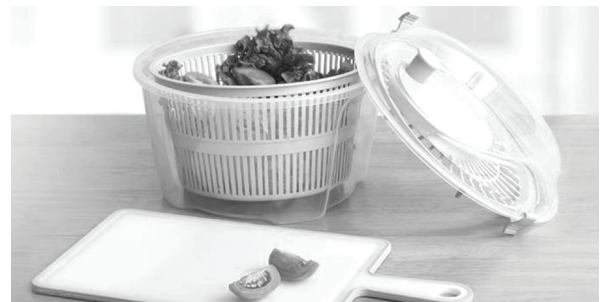
Wash and dry vegetables thoroughly with this Gondol Vega Salad Spinner.