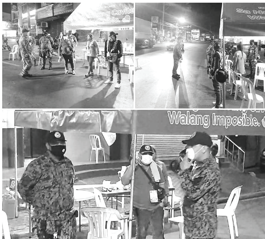
Police personnel in cities and municipalities implement stringent measures pursuant to PGC's 14-day Strict Community Quarantine.

T RECE MARTIRES CITY, Cavite --A total of 1, 554 violators of Cavite's calibrated enhanced community quarantine