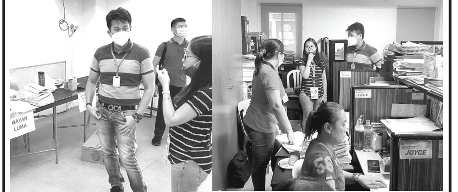
Patuloy ang validation ng ating City Social Welfare and Development Office (CSWD) sa mga naisumiteng SAC Forms at dokumento ng ating mga kababayan. Ating siniguro na tuloy-tuloy ito upang maipamahagi na ang SAP Payout sa mga qualified SAP applicants.

Upang magkaroon ng maayos na sistema at agarang matugunan ang concern ng ating mga kababayan, isinasayos na rin natin ang pagbuo ng Imus Grievance and Redress Committee. Ito ay nakasentro sa mga report ng mga kwalipikado ngunit hindi napasama sa payout, at mga nakatanggap ng payout ngunit hindi kwalipikado.