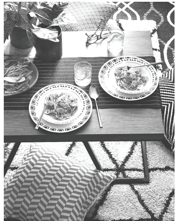
Stay home and create a new dining experience in the living room with your favourite family dish.