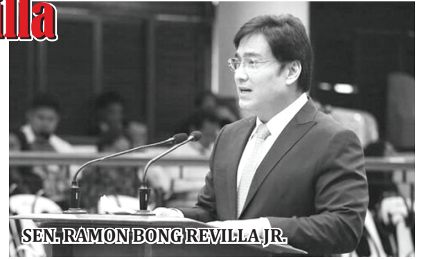
SEN. RAMON BONG REVILLA, JR.

Senator Ramon Bong Revilla, Jr. called on his colleagues to support the passage of S. No. 1319 which seeks to amend the Centenarians Law seeking the early availment of the benefits for Filipino elderlies.