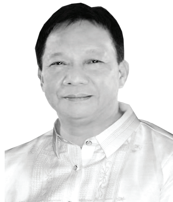
Hon. JUNIO C. DUALAN MUNICIPAL MAYOR

PLEASE PAY YOUR TAXES REGULARLY, REST ASSURED THAT THE TAXES YOU PAY WILL BE RETURNED TO YOU IN FORMS OF PROJECTS, IMPROVEMENTS AND SOCIAL SERVICES.