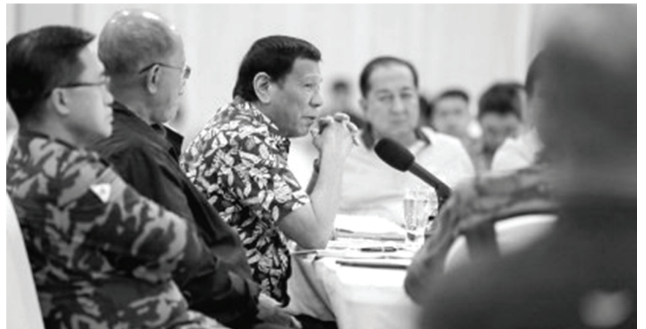
SITUATION BRIEFING. President Rodrigo Duterte holds a situation briefing on the effects of Typhoon Tisoy (Kammuri) at the Legazpi City Convention Center on December 5, 2019. Duterte said the Philippines "lost" its sovereignty when the government entered in alleged onerous water concession agreements with Maynilad Water Services Inc. and Manila Water Co.