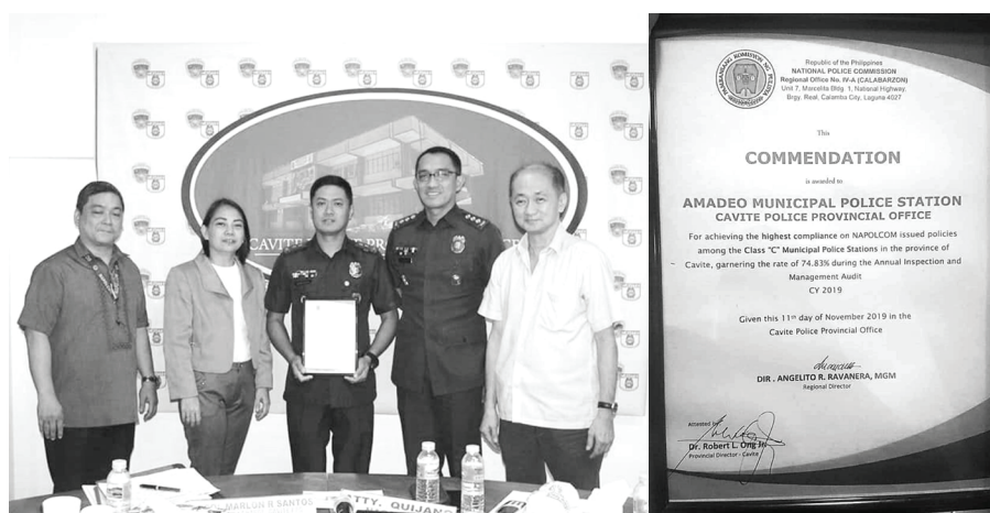
Amadeo Cavite MPS Tops Amongst Its Classification! Congratulations Amadeo PNP personnel for achieving the highest compliance rating on NAPOLCOM issued policies in the province of Cavite during the Annual Inspection and Management Audit CY 2019. RBD2019 Utryo Utryo

Southern Sparkle News and Publishing December 9, 16 & 23, 2019