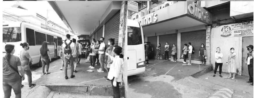
Binisita ni City Mayor Lourdes S. Cataquiz ang terminal ng Libreng sakay sa Ministop Bayan upang alamin kung patuloy na bumibiyaha ang mga saksakan patungong Bayan-bayanan at Upper villages at kalagayan ng mga pasahero. Siniguro din niya na mayroong social distancing gayundin ang pagsuot ng mask, May 27. (RMM)