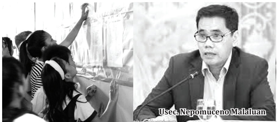
ENROLMENT. Elementary school girls look for their names on the list in this photo taken in June last year. The Department of Education started on Monday (June 1, 2020) its month-long enrollment in public schools nationwide. (File photo)