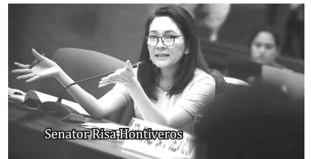
Senator Risa Hontiveros

She added that the Department of Health and other agencies should ensure that vulnerable passengers like the elderly, pregnant women, and newly-born children will have separate holding areas to better protect them from health risks, as she noted that some pregnant OFWs have