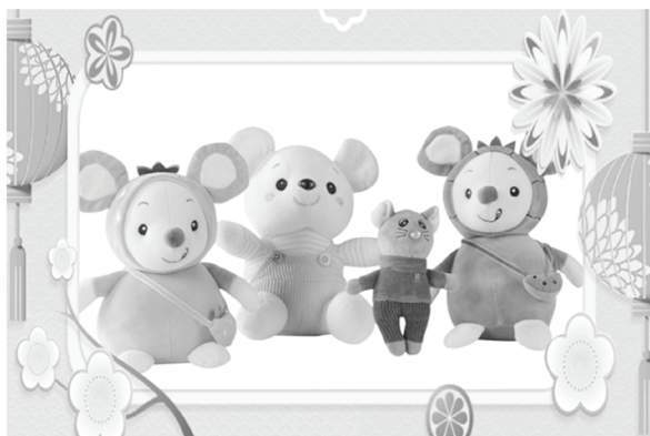
The cutest rat colony from SM Accessories Kids. Available in SM Accessories Kids department of The SM Store.