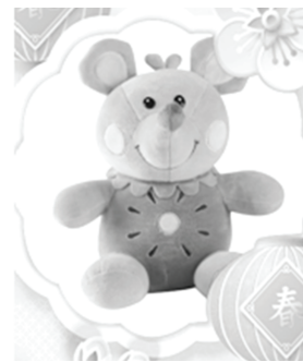
Cuddle this Kiwi rat plush toy from SM Accessories Kids this Chinese New Year.

According to Chinese philosophy, the Rat is a symbol of prudence: an inquisitive, brisk animal that rarely finds itself in a desperate situation. The child of the Rat Year fully enjoys these positive qualities of this animal: curiosity, restraint, hard work, insight, a sharp mind, and