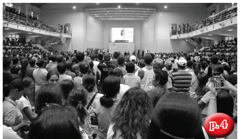
Bacoor City Mayor Lani M. Revilla assures stakeholders directly impacted by the proposed 420-hectare Bacoor Reclamation Projects of in-city relocation and a host of support programs to ensure them a decent livelihood during the public hearing held at the Strike Gymnasium last January 9, 2020. She said that the development projects were among the few reclamation projects in the country with in-city relocation program. ANALY LABOR