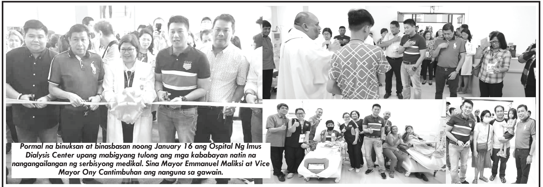
Pormal na binuksan at binasbasan noong January 16 ang Ospital Ng Imus Dialysis Center upang mabigyang tulong ang mga kababayan natin na nangangailangan ng serbisyong medikal. Sina Mayor Emmanuel Maliksi at Vice Mayor Ony Cantimbuhan ang nanguna sa gawain.