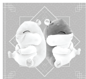
Huggable and fluffy hamster inspired plush toys to keep you company this Year of the Rat. Available at Miniso.