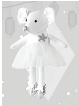
Keep the luck all - round with this pink rat plush toy from Toy Kingdom.