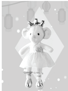
Pretty ballerina inspired rat plush toy. Available at Toy Kingdom.