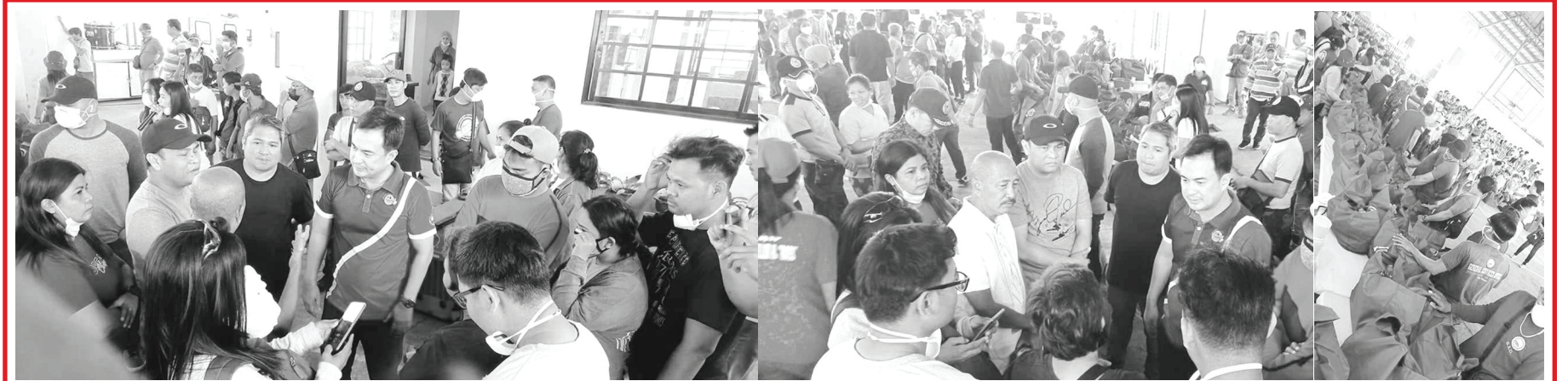
Nagtungo sa barangay mabato si Mayor Timmy Chipeco at City Government of Calamba Staff para mag bigay ng tulong o pang-ayuda sa ating mga kababayan, isa sila sa maaaring makaranas ng paglikas kung sakaling mag-adyang pumutok ang bulkan. Kung kayat pinag-usapan ng Sangguniang Panlungsod ng Calamba sa pangunguna ni Mayor Timmy Chipeco ang isang mabilis at ligtas na pagpapalano para sa paglikas at maihanda ang masisilungan ng mga taga brgy. mabato. Lagi po nating pakakatandaan ang pagkakaisa ay syang susi ng ating kaligtasan.