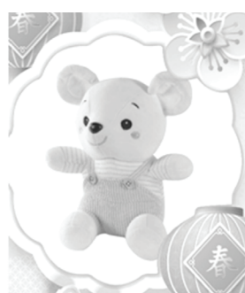
Welcome the Year of the Rat with cheerful hearts at SM Accessories Kids.