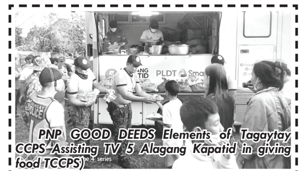
PNP GOOD DEEDS Elements of Tagaytay CCPS Assisting TV 5 Alagang Kapatid in giving food TCCPS)

Southern Sparkle News and Publishing January 13, 20 & 27, 2020