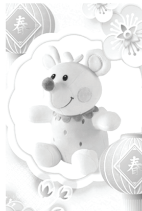
Endearing strawberry rat plush toy from SM Accessories Kids.