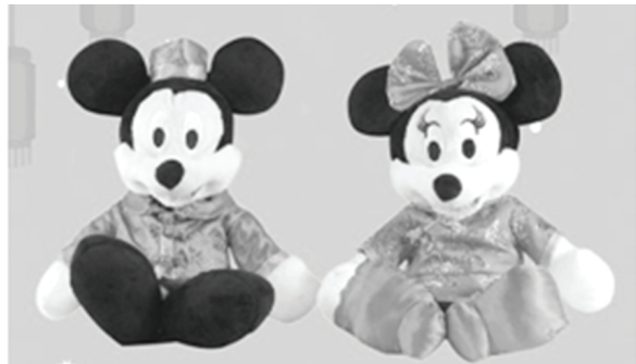
Mickey and Minnie Mouse lead the celebrations in their Chinese inspired costumes. Available at Toy Kingdom.