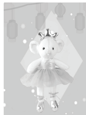
Pastel colored rat plush toy from Toy Kingdom for more charm and luck.