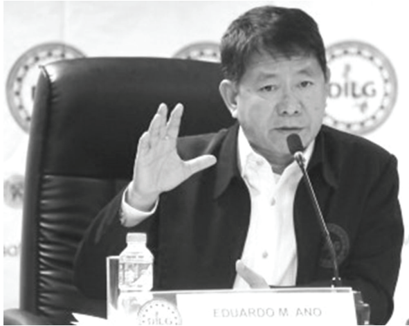
DILG Secretary Eduardo Año

M ANILA -- Interior Secretary Eduardo Año on Saturday expressed hope that President Rodrigo R. Duterte would finally name the next chief of the Philippine National Police