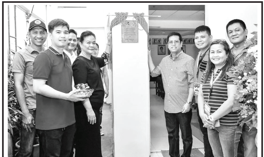
Congresswoman Dahlia Loyola also graced the blessing and inauguration of the Multi-Purpose Building in Barangay Bancal, Evacuation Center in Barangay Lantic, and the Pedestrian Overpass with Elevator in Barangay Mabuhay (Check-point), all in the town of Carmona.