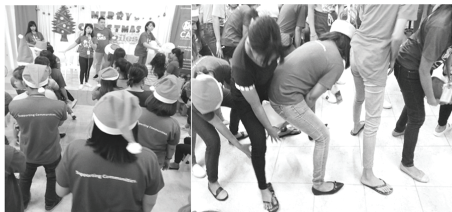
Beneficiaries and employees actively participated during the exciting parlor games.