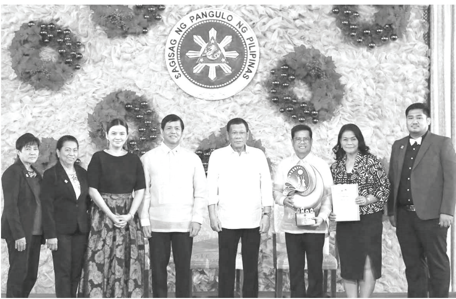
The Municipality of Carmona received the 2018 Presidential Award for Child-friendly Municipalities and Cities during the national awarding at the Malacañan Palace on November 28, 2019. Carmona has been one of the four finalists under the first to third class municipality category. The municipality was validated last June 10 to 13 and was given the Seal of Child-friendly Local Governance from DILG, DSWD, and CWC. In 2017, Carmona also received the same Presidential Award under the same category.