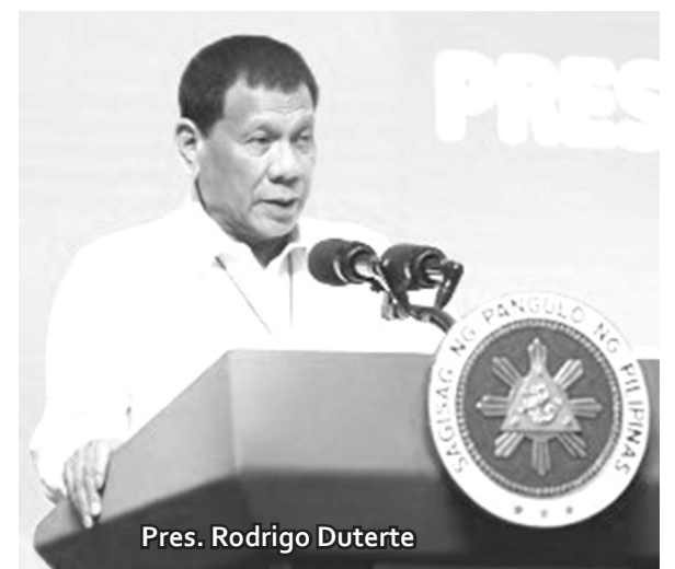
Pres. Rodrigo Duterte

commodations, and other logistical issues have dogged this year's SEA Games, ahead of its formal opening on November 30.