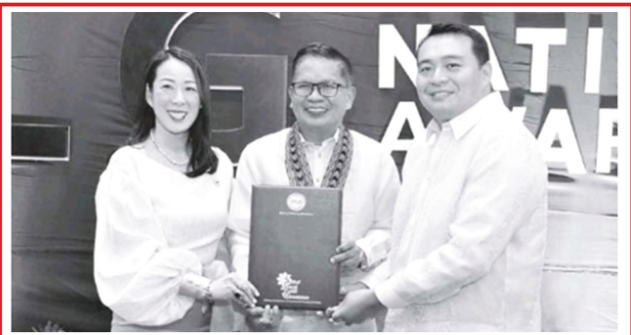
Rep. Marlyn "Len" Alonte-Naguia, Mayor Arman Dimaguila and Vice Mayor Angelo "Gel" Alonte received Biñan's third Seal of Good Local Governance from the DILG.

Vol. XI No. 08 DECEMBER 2-8, 2019 P10.00