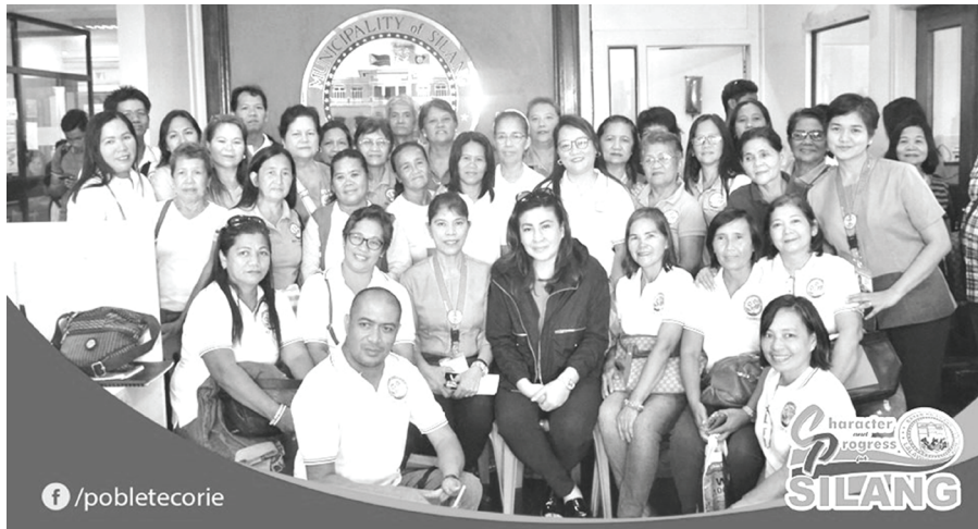
A souvenir photo with Silang Cavite Mayor Socorro Rosario "Corie" F. Poblete after the latter's courtesy call of Federation of Ornamental Plant Growers (CP FB)