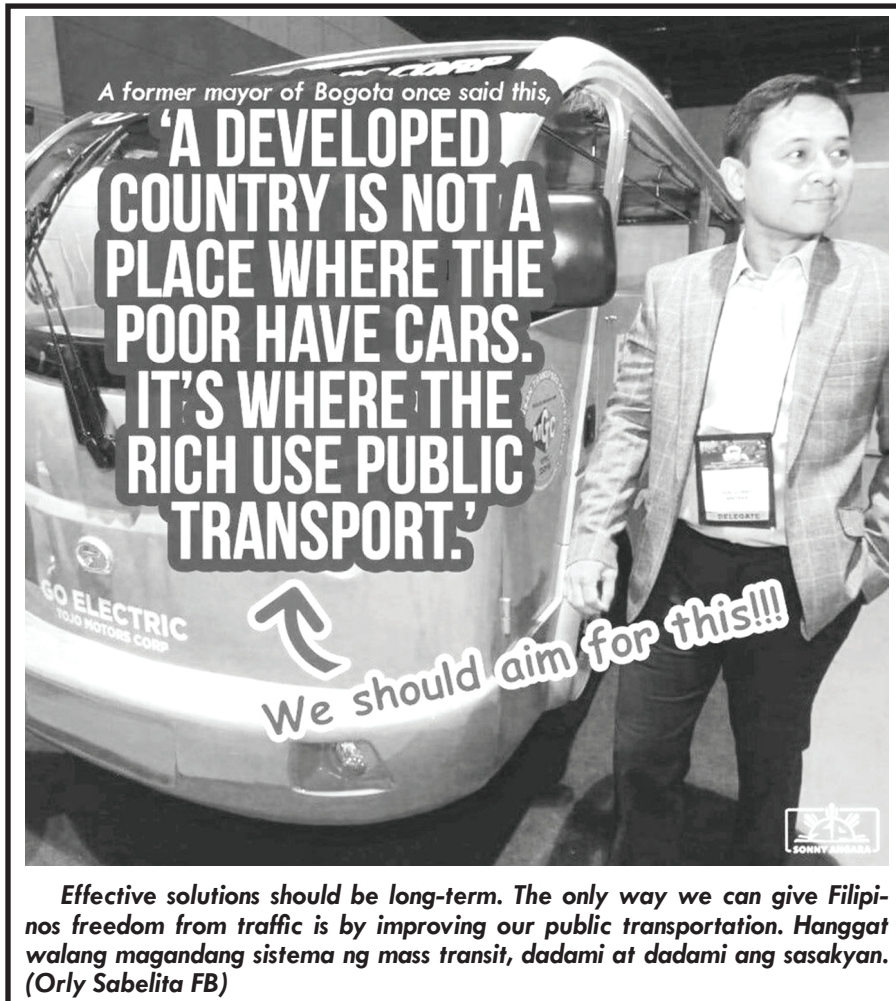
Effective solutions should be long-term. The only way we can give Filipinos freedom from traffic is by improving our public transportation. Hanggat walang magandang sistema ng mass transit, dadami at dadami ang sasakyan. (Orly Sabelita FB)