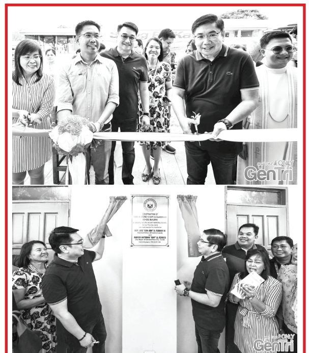
Blessing and Turn-over Ceremony of the newly-constructed Four Storey, Eight Classrooms School Building in General Artemio Ricarte Memorial School, Four Storey, Twelve Classrooms in General Trias Memorial Elementary School and Four Storey, Eight Classrooms in Luis Y. Ferrer Jr. West National High School.