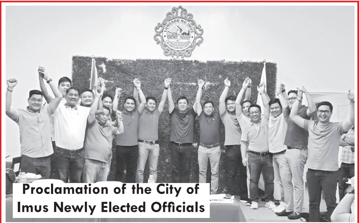
Proclamation of the City of Imus Newly Elected Officials