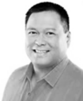
Sen. JV EJERCITO