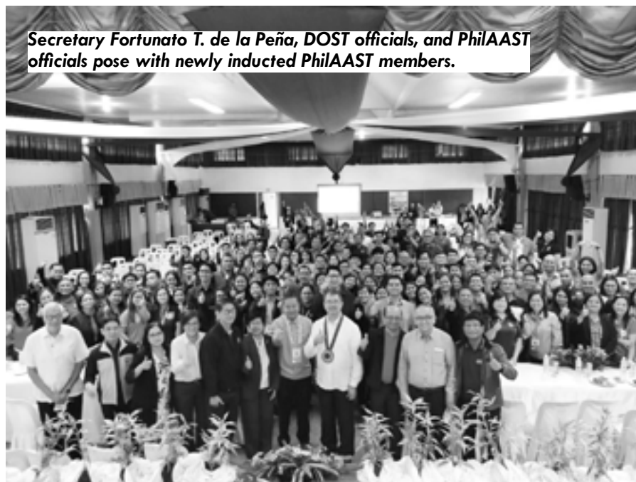
Secretary Fortunato T. de la Peña, DOST officials, and PhilAAST officials pose with newly inducted PhilAAST members.