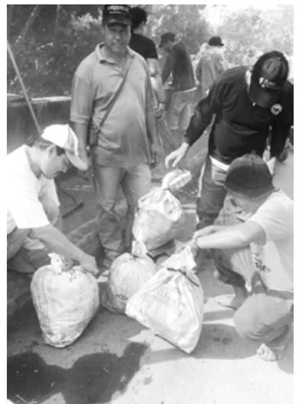
Barangay Balite Dos Clean Up movement. January 27, 2019 Pakikiisa sa Manila Bay Clean up , Pangalagaan ang Kalikasan para tyo ay mapangalagaan din nito..... lead by the elements of Silang MPS under the direct supervision of PCI Resty E. Soriano COP .(Silang PCR)