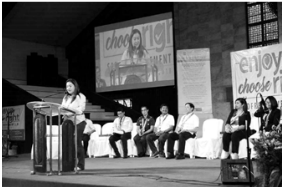
Smoking, Alcohol and Drug Free Silang Seminar/Workshop for Silang Sangguniang Kabataan Officials held recently at the Adventist University of the Philippines. Reality tells us that social problems such as smoking, alcohol and drugs are getting more and more prevalent on our youths. These social sicknesses have and will always be a hindrance for any young individual reach his or her dreams. That's why we launched this SAD Free Movement. This is our comprehensive and holistic program enabling our youths to be more aware and more intentional in being responsible and productive members of the society.